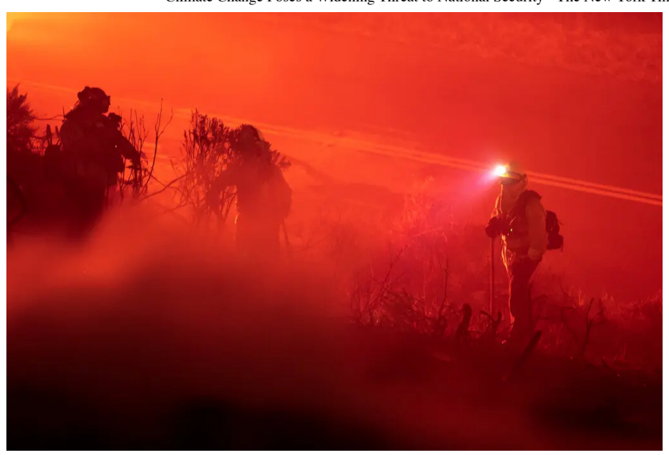
Firefighters battling the Alisal Fire near Goleta, Calif., this month.

The intelligence report identified 11 countries as being particularly vulnerable to the effects of climate change and particularly unable to cope with its effects. That list included four countries near the United States, among them Guatemala and Haiti; three countries with nuclear weapons (North Korea, Pakistan and India); and two countries, Afghanistan and Iraq, that the United States invaded in the aftermath of the 9/11 attacks.