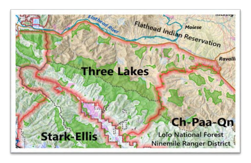
Figure 1. Three Lakes BMU with secure core (green) and lower elevation spring range along the Flathead River and Ninemile Creek.

In large secure core within and adjacent to Grizzly Bear Recovery Areas, BMUs go to the top of watershed divides. In connectivity habitats, with a few exceptions, BMU boundaries go over the top of watershed divides because most secure core habitats overlap these features and are the best routes for grizzly bears based on least-cost path analysis (Peck et al. 2017; Walker and Craighead 1997) and coincide with the upper elevations in the center of mountain ranges. Thus, BMUs in connectivity areas have spring riparian ranges on two sides while having suitable fall, denning and secure core habitats at higher elevations. Figure 1 illustrates this concept, showing the proposed Three Lakes BMU within the Ninemile Demographic Connectivity Area which contains spring habitats on the North and South edges of the BMU.