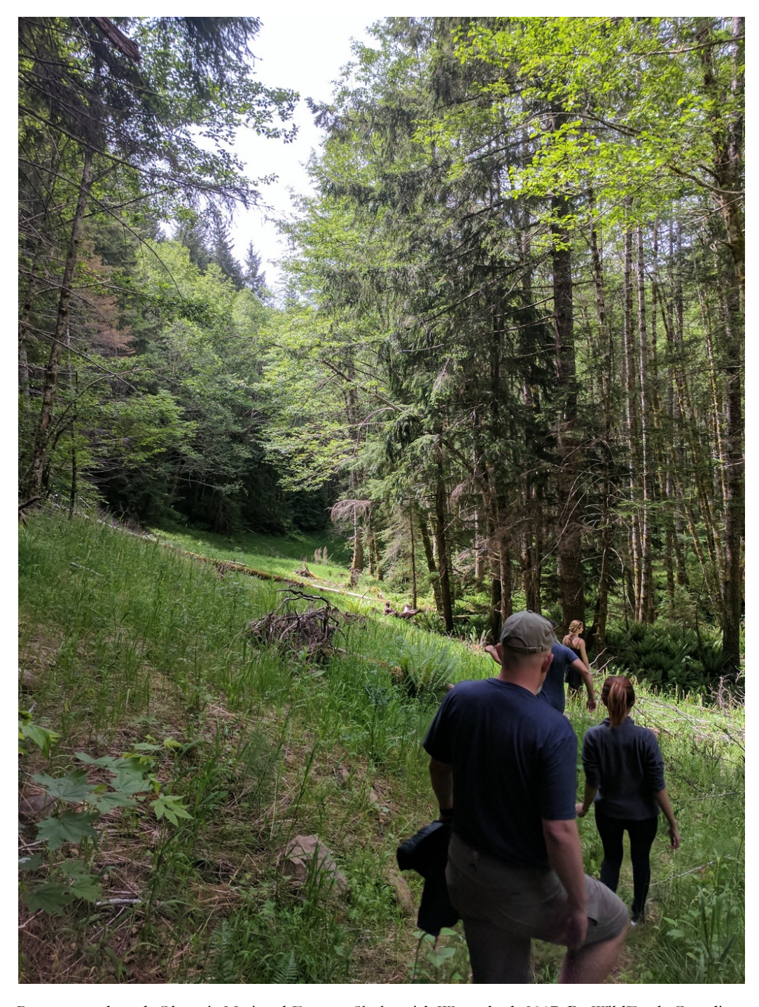
Recontoured road, Olympic National Forest - Skokomish Watershed, 2017.