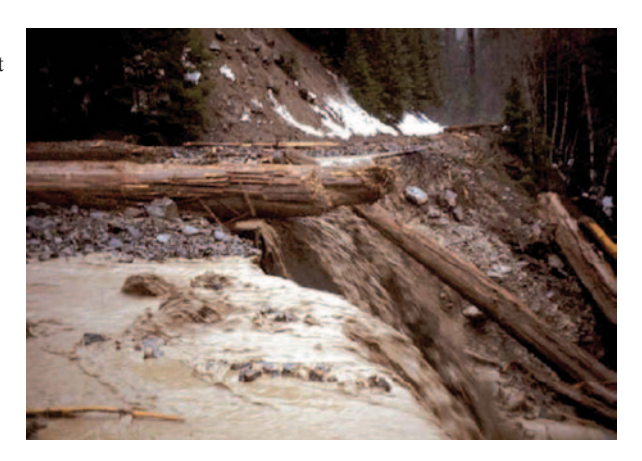
Fig. 16.9 Road in H. J. Andrews Experimental Forest rapidly eroding because of flow diversion. (Grant and Swanson 2007)

changes in both flow routing due to roads, and in water balance due to treatment effects and vegetation succession."