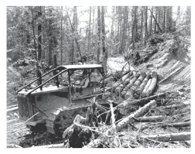
Fig. 16.5 Tractor skidders had much higher capacity than horse logging but caused increased watershed disturbance.

location restrictions, grade control, or water control (Weitzman and Trimble 1952; Table 16.1). Roads constructed by loggers with no restrictions or water control requirements also resulted in stream turbidities that far exceeded those from better planned skid roads (Reinhart et al. 1963). Time studies showed the advantages of