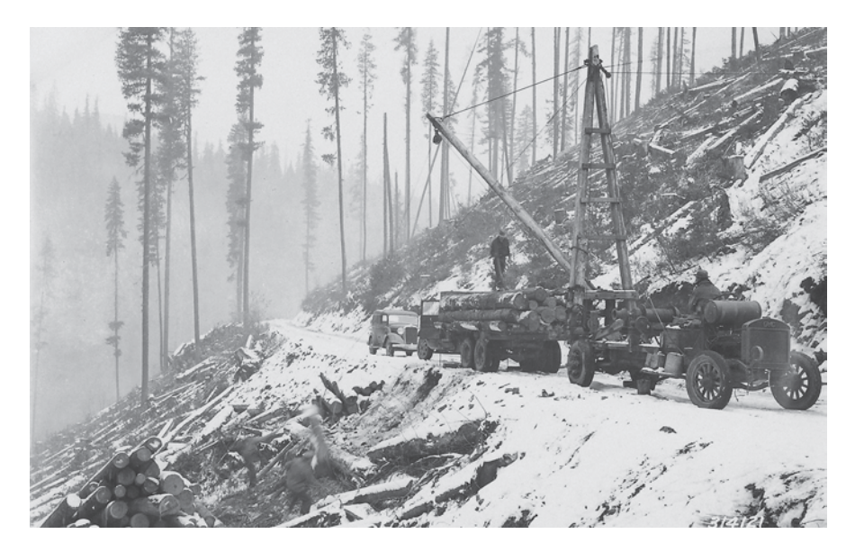
Fig. 16.3 An "Idaho jammer" cable yarder at work in Deception Creek Experimental Forest, December 1935.

the Deception Creek Experimental Forest will likely be removed (Fig. 16.2). Watershed researchers are now working with silviculturalists to plan a research project that will evaluate changes in watershed health associated with road removal (R.T. Graham pers. comm., Sept. 2009).