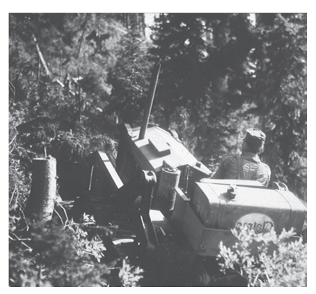
Fig. 16.1 Building a road in Deception Creek Experimental Forest in the 1930s.

problems and in identifying management practices to minimize them. From the very beginning of experimental forests, roads have allowed managers and researchers access to research sites, aided in fire suppression, and allowed the public to view ongoing research projects (Fig. 16.1; Wellner and Foiles 1951). Through research that started in experimental forests (Patric 1977), roads are now recognized as a major source of sediment in forested watersheds, with sediment from roads exceeding that from any other source in the absence of wildfire (Elliot 2010). This chapter contains examples of research related to roads in experimental forests: (1) using roads to aid in forest management, (2) identifying roads as a sediment source in forests, (3) predicting the effects of roads on runoff, (4) evaluating the effects of reopening roads that have been closed, and (5) developing predictive models.