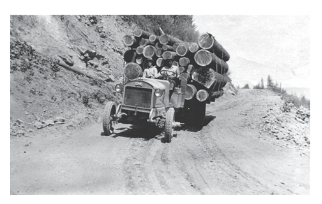
Fig. 16.7 Logging road in the 1930s. Note the lack of an inside ditch and the eroding ruts on the road surface.

It is likely that the foresight of the first Fernow researchers who simultaneously studied technical, economic, and environmental outcome-based research resulted in greater and faster acceptance of the recommendations than otherwise would have occurred. They were able to show that implementation of practices to protect soil and water resources were not incompatible with reducing costs and operation times.