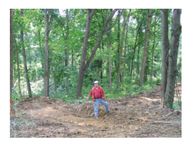
Fig. 16.6 Water bar constructed on a modern skid trail following guidelines developed in the Fernow Experimental Forest in the 1950s.

Within these studies, early Fernow Experimental Forest researchers acknowledged the important role that water control and drainage played in maintaining usable road conditions and reducing erosion. Consequently, researchers employed erosion data to develop the first set of water bar spacing recommendations for the Appalachians (Table 16.2; Trimble and Weitzman 1953; Weitzman 1952a). These spacing recommendations, along with the recommendations for skid road location, construction, and maintenance practices, formed the foundation for what eventually became the base set of road-related best management practices (BMP) for many eastern states (Fig. 16.6). In fact, West Virginia used these original water bar spacings until a BMP revision in 2005 reduced and simplified the spacing requirements.