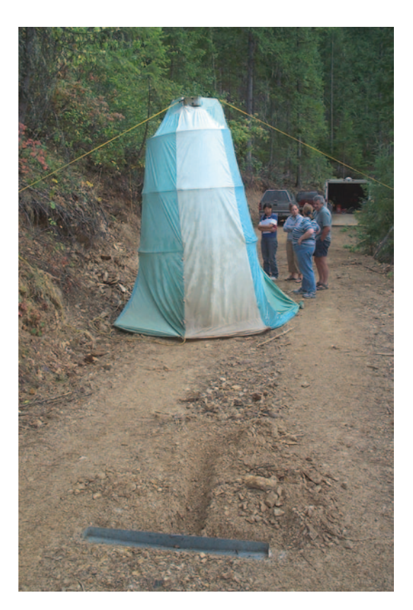
Fig. 16.10 Rainfall simulator (in background under canopy) and plot from previous run (in foreground) measuring changes in forest road soil erodibility when a closed road is reopened for fuel management activities in the Priest River Experimental Forest.