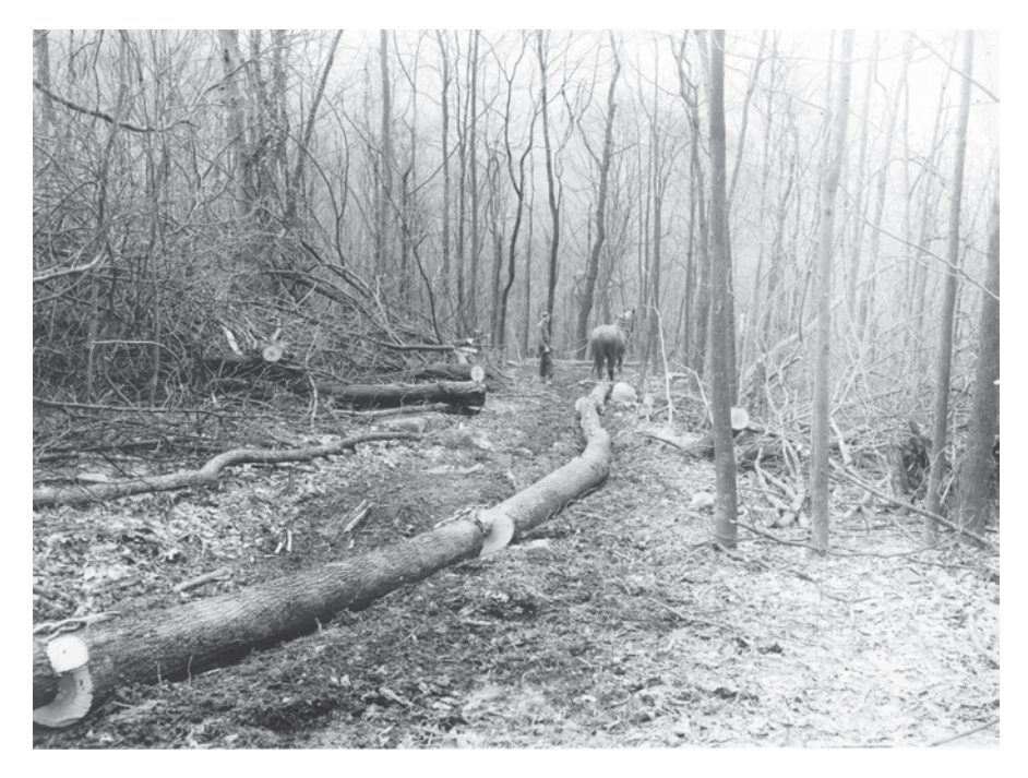
Fig. 16.4 Horse logging in the Appalachians.