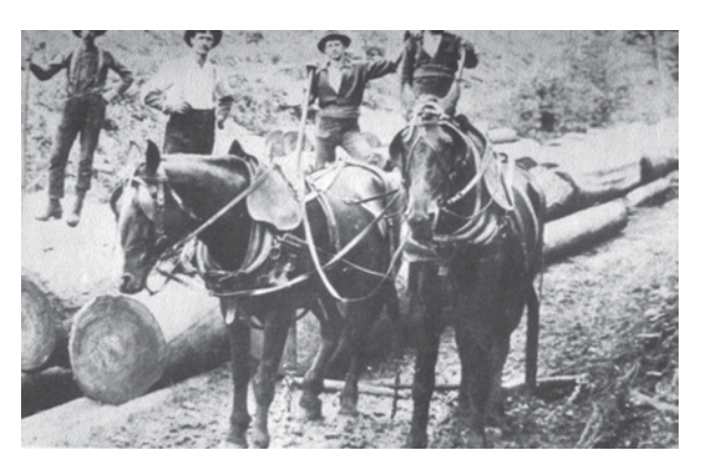
Fig. 16.8 Horses deliver logs to a North Carolina landing in 1903.

to much different standards or using different practices or techniques than are traditional on forest roads. Little is known about the impacts of such development, so it is expected that the results of these new studies will be as cutting edge as the initial Fernow skid road research was in the 1950s.