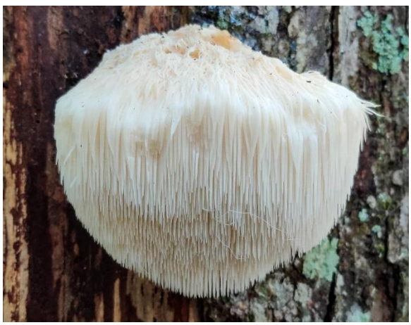
Delicious Lion's Mane (never eat wild mushrooms unless you know what you're doing!)