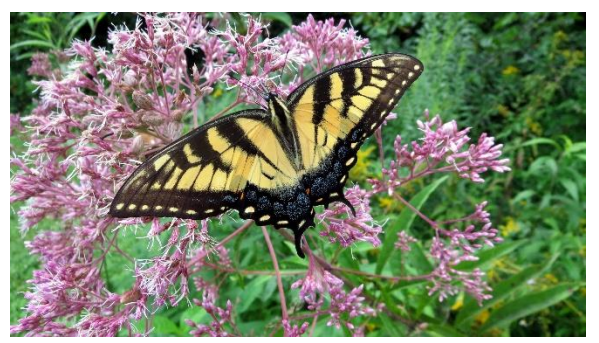
Eastern Tiger Swallowtail