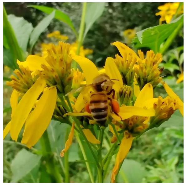
Honey Bee covered in pollen