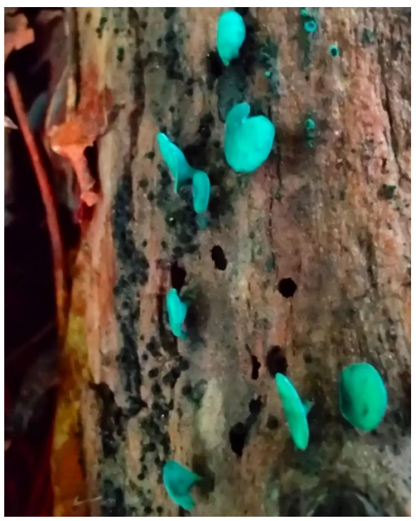
Blue fungi, which rarely emerges as mushrooms like these