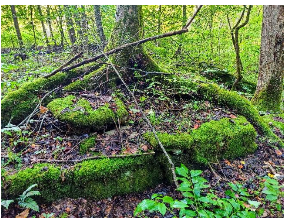
Moss is seemingly everywhere on everything