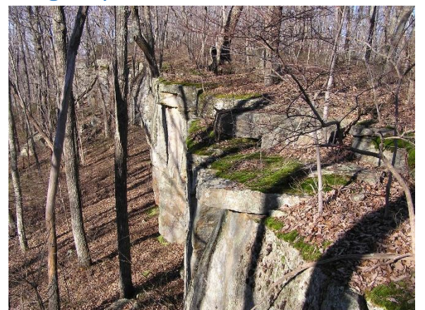
Ridgetops lined with cliffs