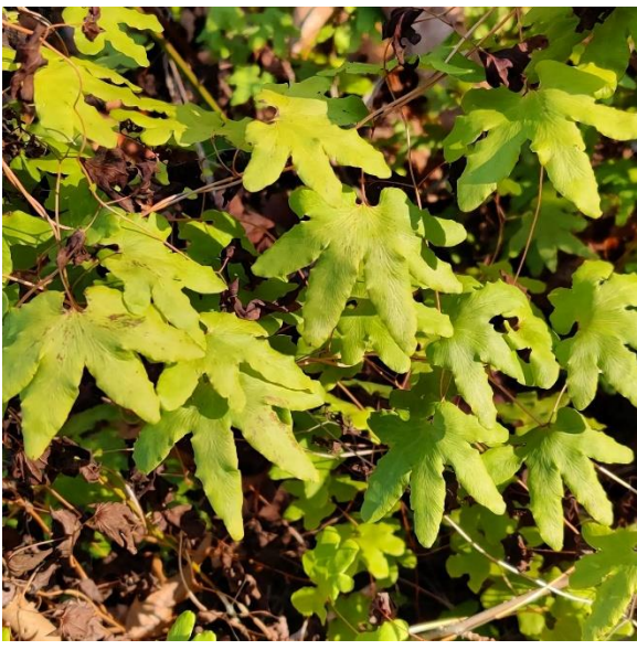
American Climbing Fern, which became the first protected plant species in the United States in 1869

We haven't personally discovered any threatened or endangered species in the Jellico Mountains, but we've spotted a few uncommon species.