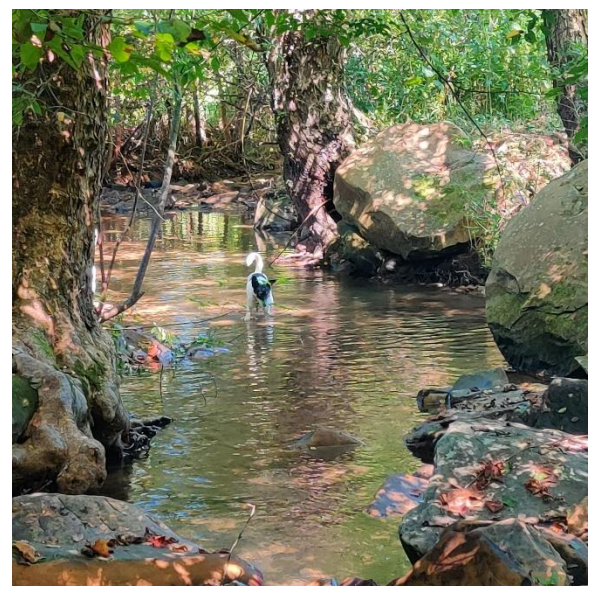
Normally placid Jackson Creek