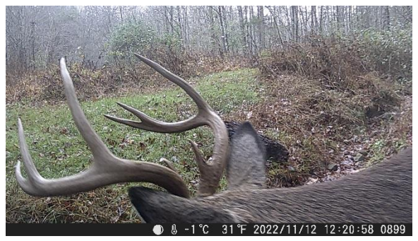
Buck laying low as hunting season begins