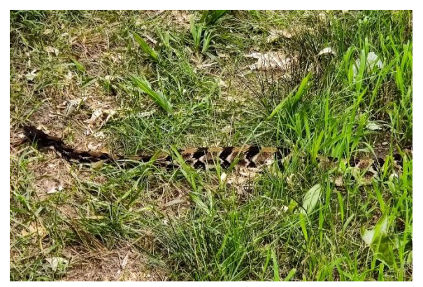
Venomous Timber Rattlesnake