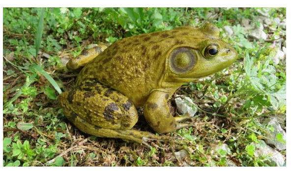
American Bullfrog, which is Kentucky's largest frog, growing to 8 inches long