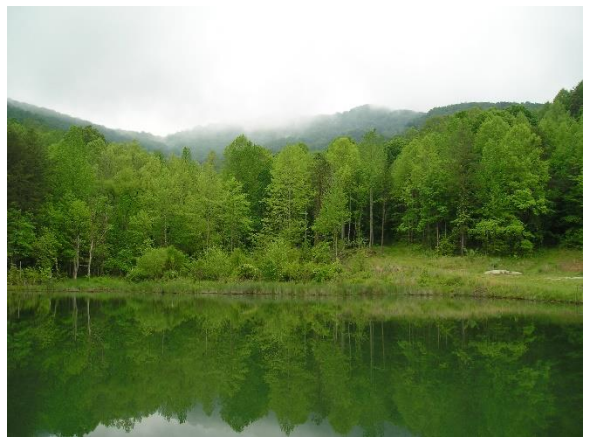
Ponds full of Bluegill and Smallmouth Bass