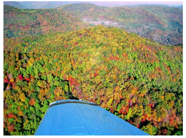
Sunny, warm days and spectacular colors in autumn