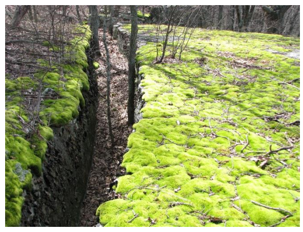
This moss-covered boulder sits near a prescribed clearcut tract. How will it fare in the logging?