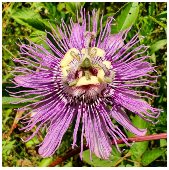
Maypop, aka Purple Passion Flower