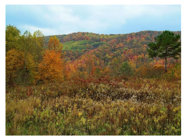
This photo of Wolf Knob Mountain in autumn shows the scars of two-aged shelterwood treatments by the USFS in 1990.