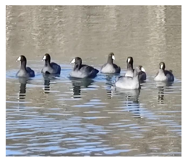
American Coots resting for a day on their annual migration south