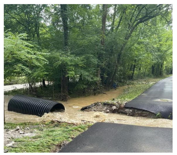
Little Wolf Creek Road washed out in the July 2022 mega flood.