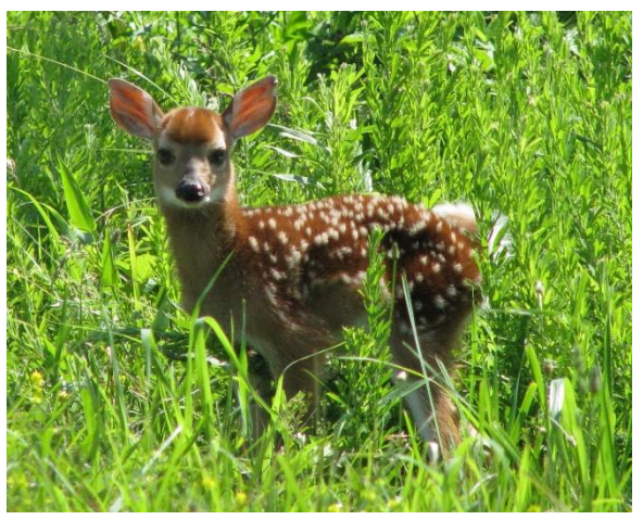
Lots of new fawns every spring