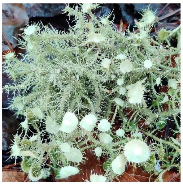
Medicinal Usnea appears almost alien