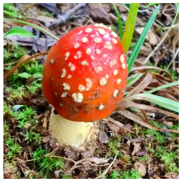
Home of Keebler elves