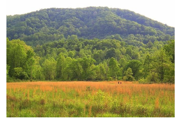
There used to be an historic fire tower atop Wolf Knob Mountain.