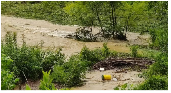
Jackson Creek during the July 2022 mega flood