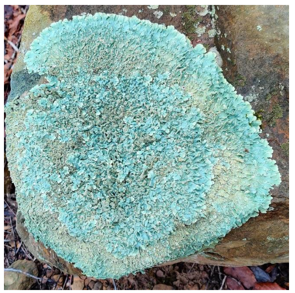
Giant patch of lichen on a rock