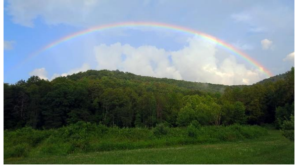
Rainbows in spring