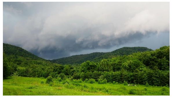
Thunderstorms and intense green in summer