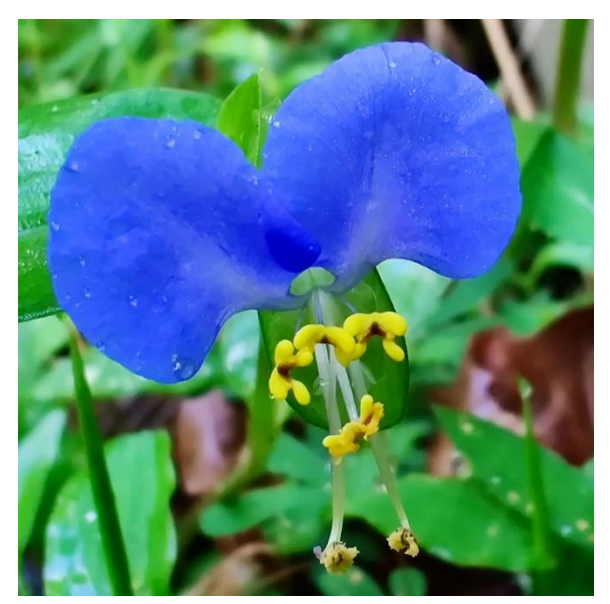
Asiatic Dayflower, which lasts for one day only