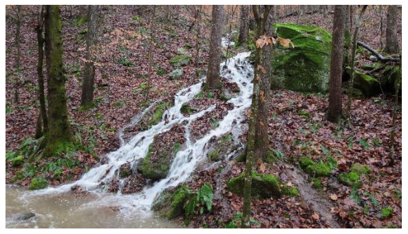
Waterfalls appear after a rain