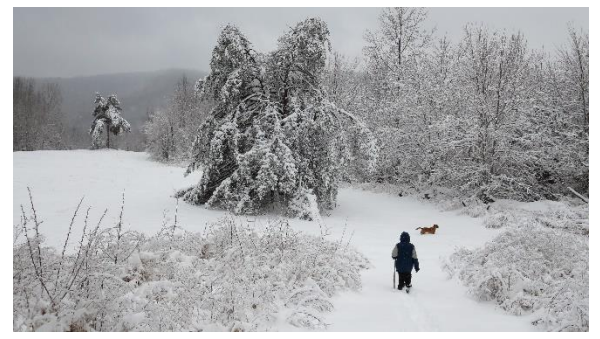
Occasional heavy snow in winter