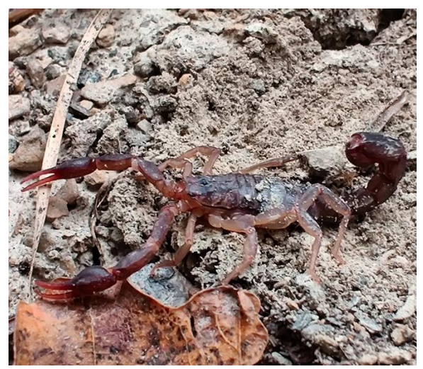
Surprisingly docile Southern Unstriped Scorpion