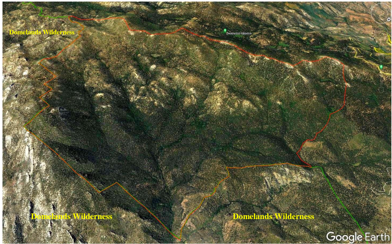
Figure 3. – Proposed Domelands Wilderness Addition-West viewed from NE to SW.

The Cannell Meadows Trail (33E32) and all roads have been drawn out of the suggest boundaries for the area in Figures 2 & 3, and the Sirretta Trail (34E12) is planned for closure to motorized use in the future. See FEIS Appx. B, p. B-63 ("The Sirretta Trail is identified in the Mediated Settlement of 1990 for removal or replacement.").