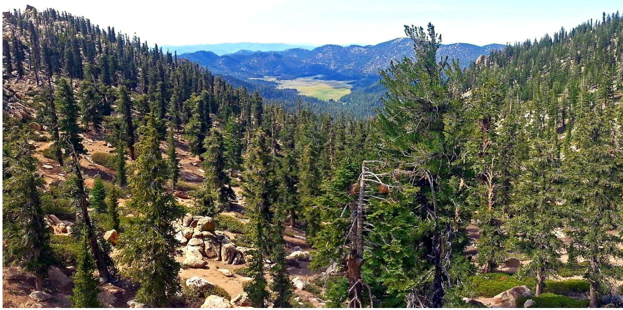
Figure 3. – View looking south from Sirretta Pass towards Big Meadow in the Twisselmann Botanical Area, Kern Plateau, Sequoia National Forest.

As discussed in the next section in greater detail, the Forest Service, long ago, promised all parties during the last plan revision in 1990 (as documented in the Mediated Settlement Agreement (MSA)), to either relocate or close the Sirretta Trail (34E12) to motorized use. The parties to the MSA were promised this resolution over 30 years ago, but it took another ten years for the Forest Service to publish their revised Draft EIS, issued in 2002. The revised Draft EIS supports closure of the Sirretta Trail to motorized use in all alternatives, but has now been languishing "on hold" since that time...for the last 20 years! See FEIS Appx. B, p. B-178 ("An existing motorized route, the Sirretta Trail, is identified in the mediated settlement agreement of 1990. Motorcycle use was identified as an accepted inconsistency in the area classified as semi-primitive nonmotorized until an alternative route was built or a decision not to build an alternative route was made. In either case, the current trail location would be closed to motorized use. This has not been resolved even though extensive work has been done by planning teams.")