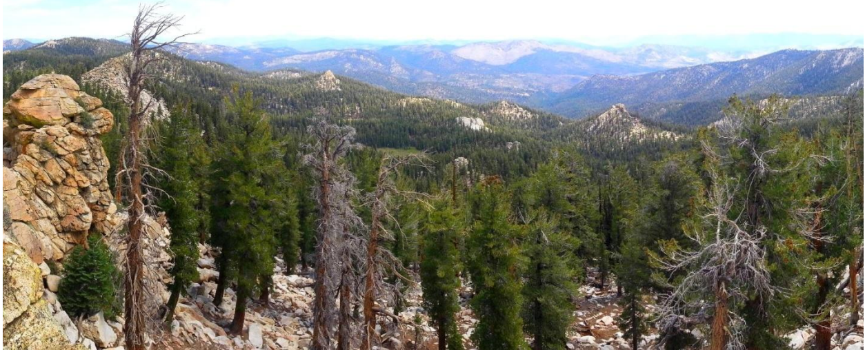
Figure 1. – Domeland Wilderness Addition-West/Woodpecker Roadless Area, viewed from Sirretta Peak ridge, north peak, looking east towards Domeland Wilderness boundary (ridge on right) and down Trout Creek where the Wilderness Boundary starts at the lowest point in the view.

Because of unique ecological resources and because the area provides significant remoteness as a primitive area and outstanding opportunities for solitude, the Plan can be improved by adding much of the Woodpecker IRA/Domeland Wilderness Addition–West to the final decision. This 8,900+ acre area is depicted by the map in Figure 2 below, which is based on a smaller portion of Polygon #1394 that excludes the entire Cannell Meadow trail (33E32), and roads, and depicts most of the western boundary at the ridgetop starting with Sirretta Peak. The boundary, as proposed, would shield the area from the sights and sounds from the Cannell Meadows Trail, which is open to motorized use and excludes all known developments and past management.