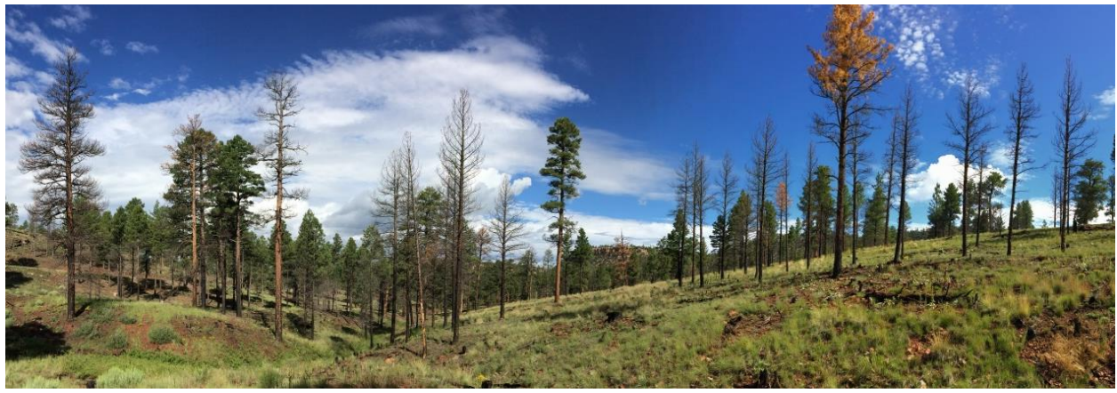
A 2 acre patch of mortality at the GTR-310 Bluewater Demonstration site following initial prescribed fire re-entry, July 2017

The cumulative effects of re-establishing frequent fires should not be understated and must be thoroughly assessed in the Rim Country effects analysis. Even with cool, low-severity burns, post-treatment mortality may range between 10% and 30% of the residual trees.<sup>23</sup> As an example, the photo below shows a portion of the GTR-310 Bluewater demonstration site on the Cibola National Forest, New Mexico. The 73-acre site was thinned to <32 ft<sup>2</sup>/acre and \sim 25 trees/acre<sup>24</sup> in 2010. Despite the very low density of the remaining forest, a patch of more than 50 trees across 2 acres were killed by the first fire entry following thinning. This unexpected incident of torching led to the death of at least three old-growth trees and calls into question the efficacy of attempts to restore desired structure without consideration of the aggregate effects of re-establishing frequent fire.