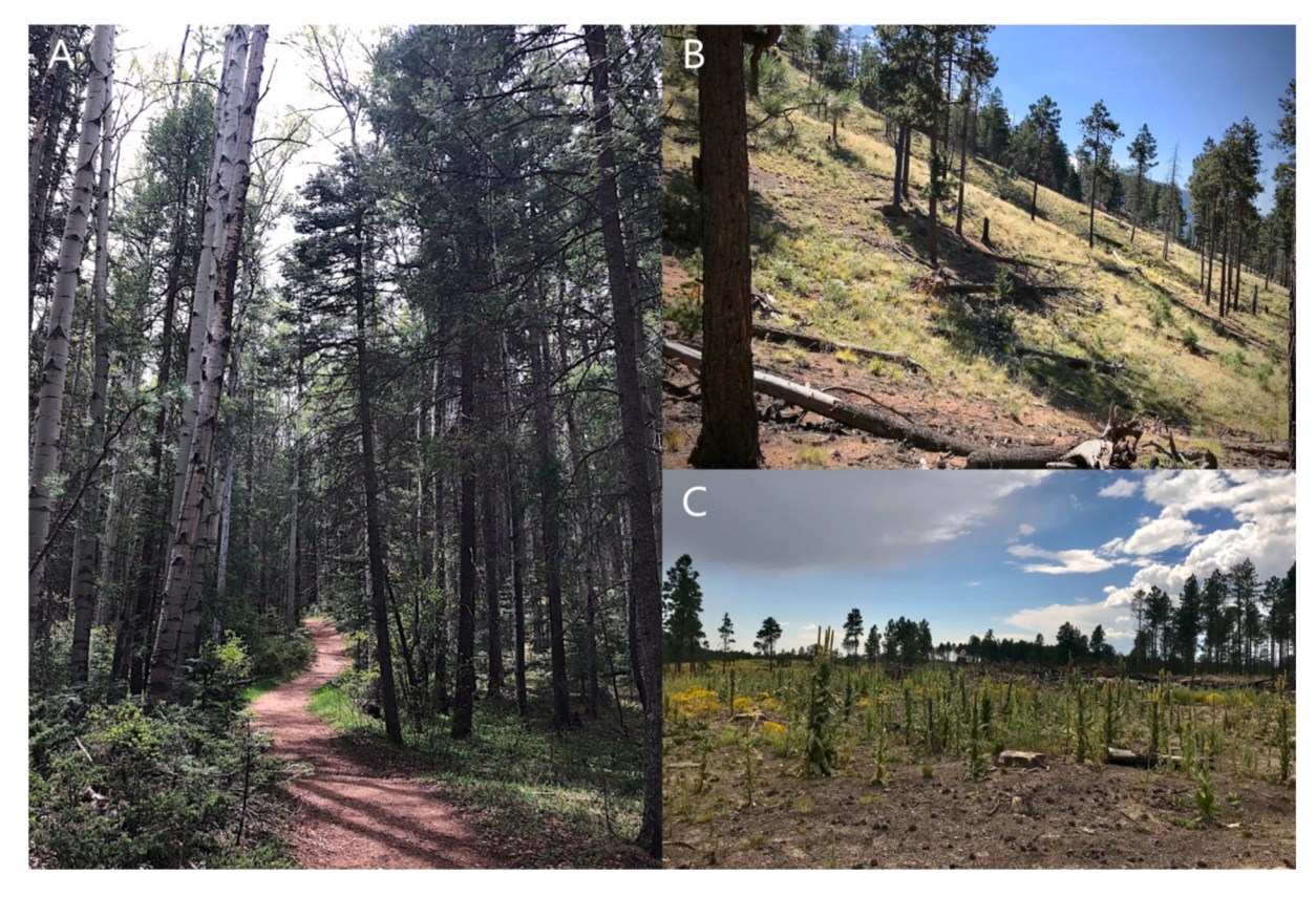
Fig. 4. (A) Older mixed conifer forest in the Santa Fe watershed, New Mexico. (B) Heavy thinning just upslope of (A) ostensibly to reduce flame heights. (C) Southwest Jemez Mountains "Landscape Restoration Project" approved by collaboratives on the Santa Fe National Forest.

(Miller and Thode, 2007), many studies over the last decade have continued to use dNBR to assess fire severity in thinned areas to determine efficacy in altering crown fire occurrence. Moreover, the question of whether dNBR or RdNBR accurately estimates fire severity—particularly high severity—in thinned compared to unthinned areas has not been sufficiently addressed. Thus, there is reason for concern that highseverity fire is substantially underestimated in thinned areas (Online supplemental materials, Fig. S1, Table S1). Moreover, we note that articles reporting localized fire-severity reductions from thinning (e.g., Hessburg et al., 2021) do not account for tree mortality from thinning itself, before wildfire occurs, which is substantial oversight in assessing treatment effect (Hanson in press).