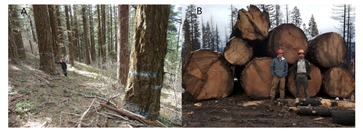
Fig. 3. (A) Nedsbar Timber Sale Medford District BLM Applegate Watershed (for "fuel reduction") showing "take tree" markings. (B) Postfire logging on Takilma Happy Camp Road in response to the Slater fire, Rogue River-Siskiyou National Forest. These trees were regarded as fire hazards.

One of the primary justifications for thinning projects on federal lands is the assumption that such activities will reduce subsequent fire severity and the prevalence of active crown fire. Studies that have reported a reduction in fire severity in areas that were thinned prior to wildfire (e.g., Shive et al., 2013, Kennedy and Johnson, 2014) have typically used the delta normalized burn ratio (dNBR) and relativized dNBR (RdNBR), which are based on discriminating among certain spectral bands of pre- and post-fire 30-m resolution Landsat images (Key and Benson, 2005). While RdNBR has been shown to more accurately classify fire severity in sparsely vegetated areas compared to dNBR