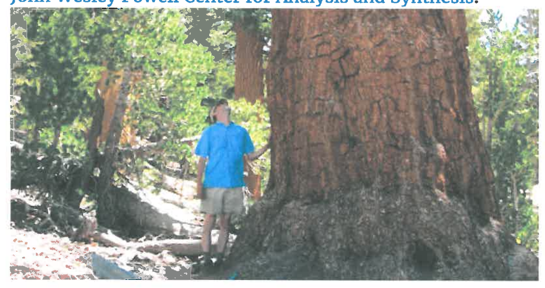
Scientists analyzed data from 403 species of trees from around

The study was a collaboration of 38 researchers from research universities, government agencies and nongovernmental organizations from the United States, Panama, Australia, United Kingdom, Germany, Colombia, Argentina, Thailand, Cameroon, Democratic Republic of Congo, France, China, Taiwan, Malaysia, New Zealand and Spain. The study was initiated by Stephenson and Das through the USGS Western Mountain Initiative and the USGS John Wesley Powell Center for Analysis and Synthesis.