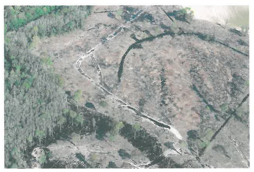
An area of clearcut forest in the Tar-Pamlico River basin in northeastern North Carolina

but their emissions have not been reduced at the same rate as their coal reductions would indicate because a big part of their replacement is from burning wood in the form of wood pellets that primarily come from the Southeastern U.S. The largest coal plant [in the UK], Drax, has converted half of its units to burning wood pellets instead of coal. And there are a bunch of other power plants in the UK that are doing the same thing, and the same thing is happening on the continent. And they claim it's carbon-neutral.