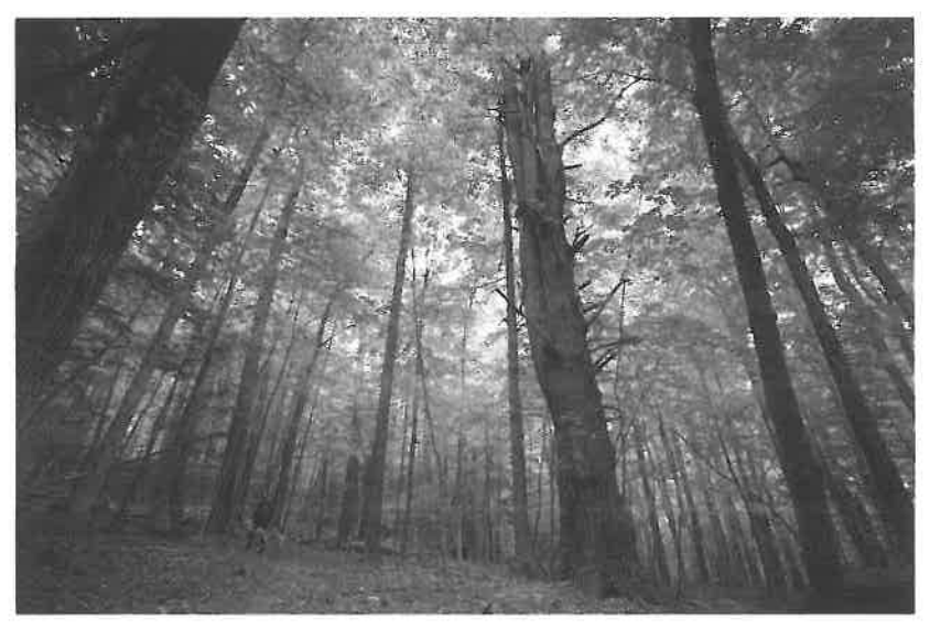
A mature forest in the Berkshire Hills in western Massachusetts.

citizens has been enormous. There's pressure to build a wood-burning electric power generating station in a low income neighborhood in Springfield, Massachusetts. And that's being pushed back against very hard by the public. But the governor and his team are pushing forward to make it happen, with more subsidies — subsidies that come from our electric bills. That subsidy doesn't go to solar panels, it goes to burning wood. We've got a real problem here.