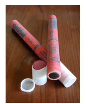
Fusees (J. Schalau photo).

There are several types of equipment and associated chemical products that may be used to ignite prescribed burns, as summarized in this section.