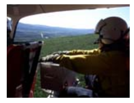
"Ping-pong ball" aerial ignition system (Forest Service Research photo).

Aerial ignition device system ("ping-pong balls"). Polystyrene spheres, about the size of ping-pong balls and containing potassium permanganate crystals, are dispensed from a machine mounted in a helicopter. Just prior to release, a small amount of ethylene glycol is automatically injected into each sphere by the dispensing machine. Within 20 to 30 seconds, the sphere ignites.