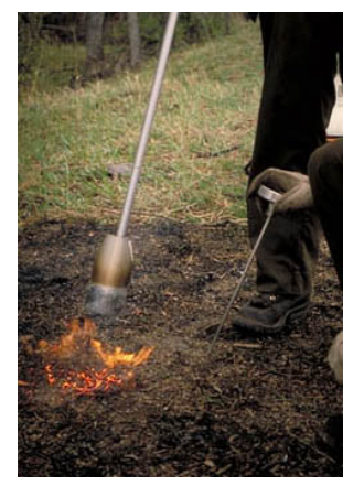
Propane-fueled wand (J. Wolf).

The chemicals that form the basis for the target fuel ignition process in each of these methods are collectively referred to as accelerants . When accelerants, or any other substances, are oxidized during the burning process, new chemicals may be formed. Many of these are gaseous or particulate chemicals that are quickly dispersed in the open air. However, it is possible that some solid or liquid residues may remain on the soil after these accelerants are used to start a prescribed burn. These accelerant residues are the focus of this risk assessment.