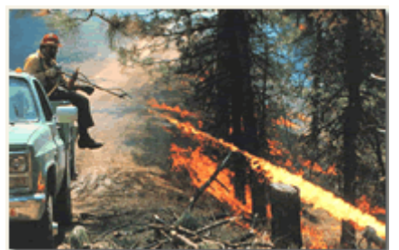
Use of gelled gasoline.

Helitorch/terra-torch or gelled gasoline in handthrown plastic bags.