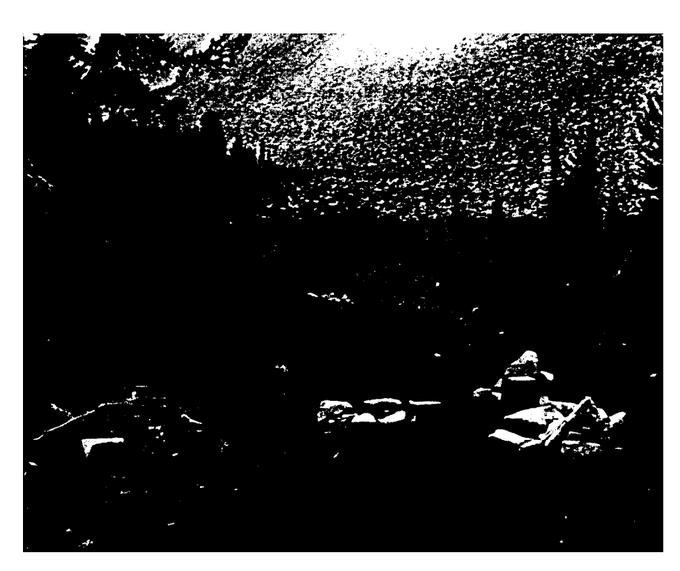
Figure 2 (Con.)