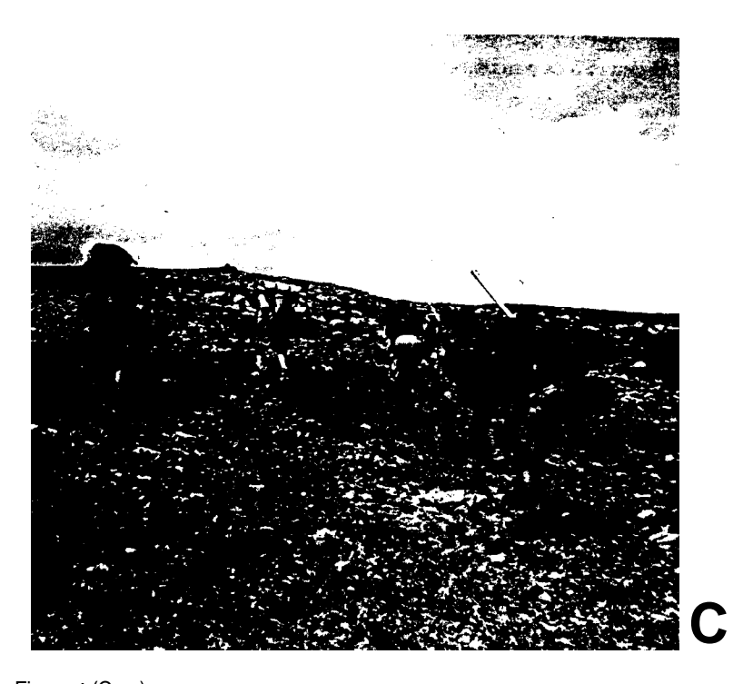
Figure 1 (Con.)