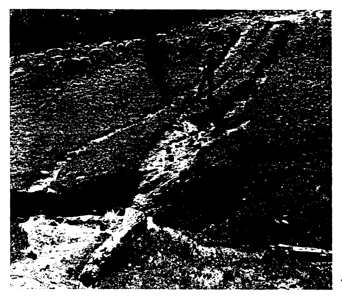
Flgure 1-Trail problems and appropriate low-impact practices. (A) Meandering systems of user-created trails develop in popular destination areas. Avoid walking on either closed trails or developing user-created trails (practice 14). (B) Muddy trails that widen into quagmires and/or become systems of braided trails are a common problem. Important practices include avoiding trips where and when soils are wet and muddy (practice 4) and, if on a muddy trail, walking single file down the main tread (practice 15). (C) To reduce the likelihood of creating undesired user-created trails, cross-country hikers should spread out (practice 19). Hikers should not mark their route (practice 20) and should select a route that crosses durable surfaces (practice 21).