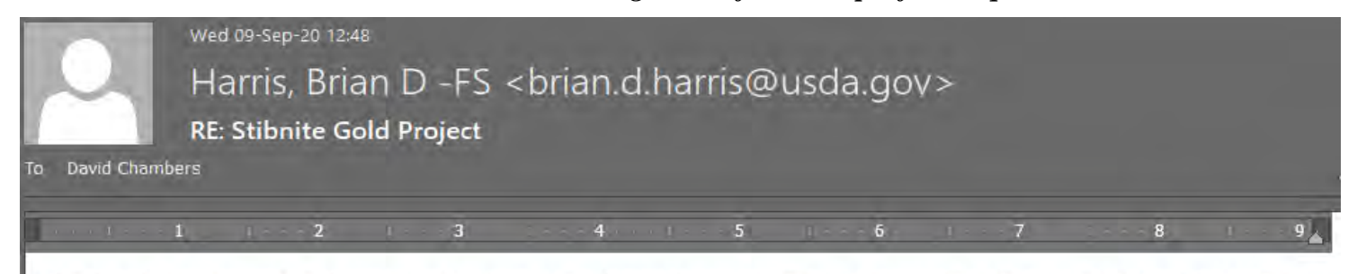
Figure 1: September 8, 2020, Chambers request to US Forest Service for reports, and September 9, 2020, US Forest Service acknowledgement of the receipt of the request

Thank you for your message and pointing out this issue. I have forwarded your message to the appropriate parties so we can have this looked in to. I will respond again as quickly as I receive information.