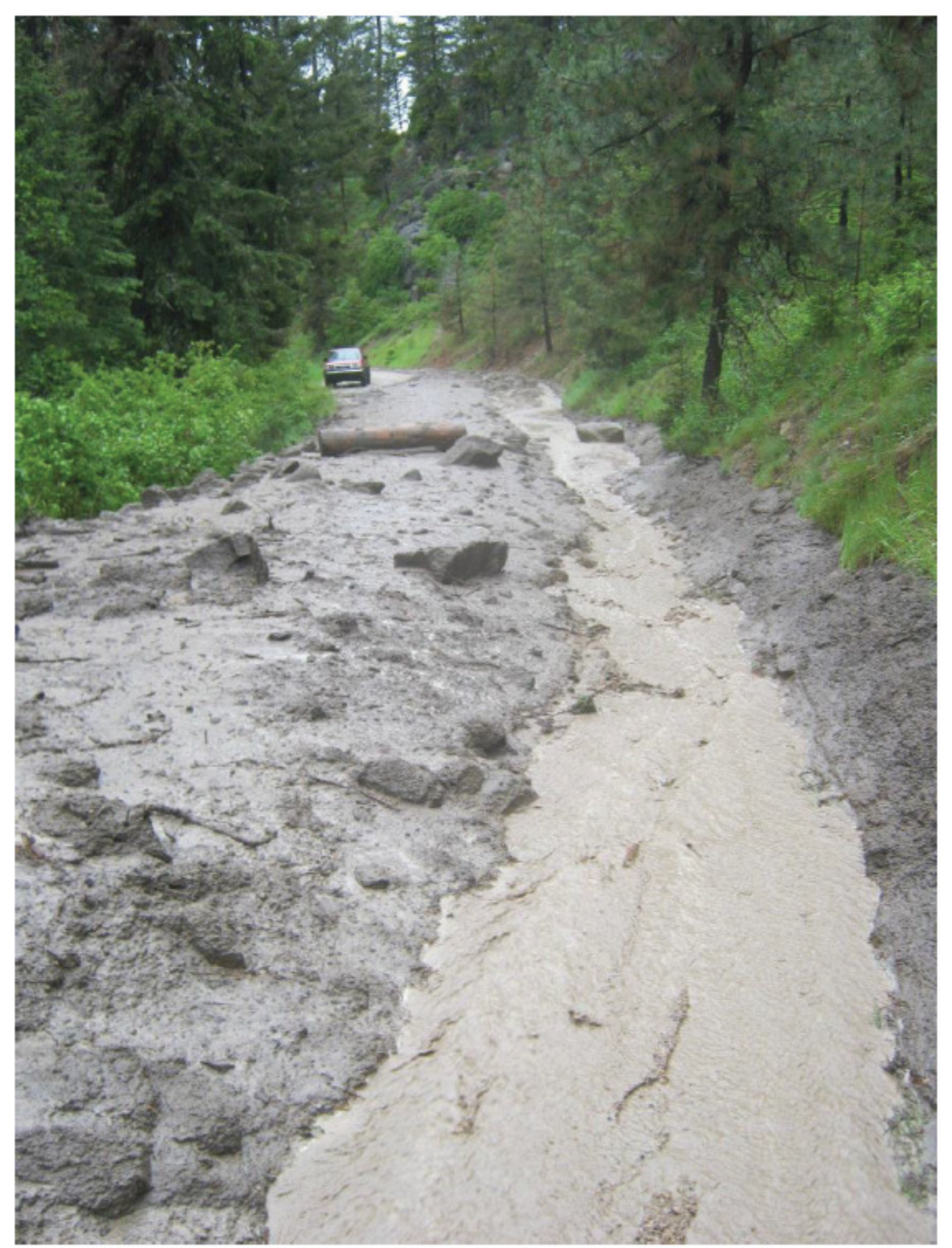
Above, debris flow, Forest Road #969, the Willow Creek Road, a primary haul route for proposed Gold Butterfly timber sale, after a storm event on June 13, 2017. The photo below is of the same area.