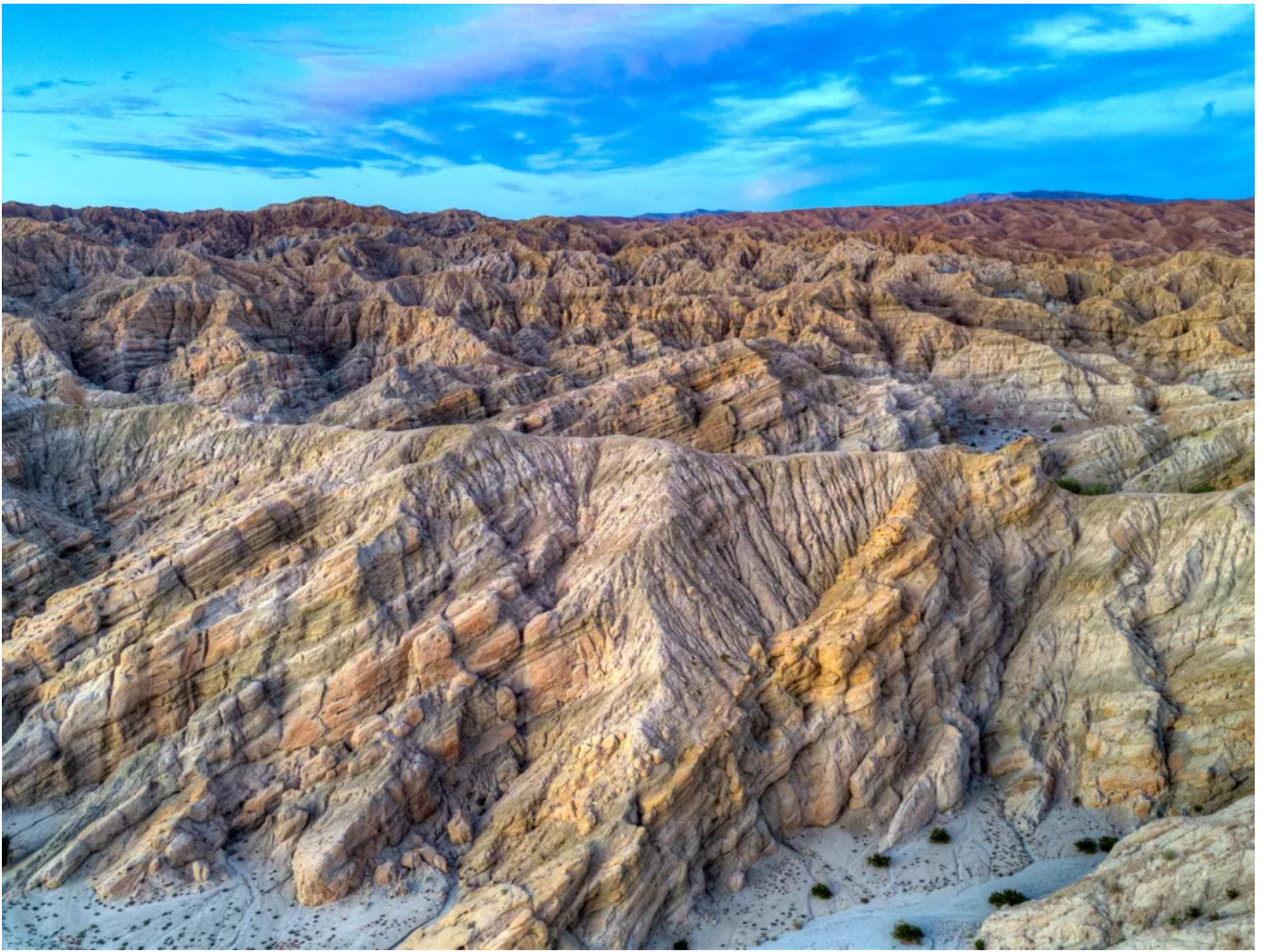
Chuckwalla National Monument, California