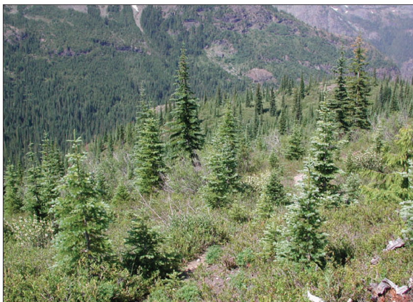
Figure 1. Stand-replacement disturbance events in forests create large areas free of tree dominance and rich in physical and biological resources, including legacies of the pre-disturbance ecosystem.