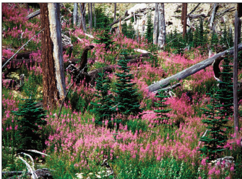
Figure 3. Plant communities with well-developed shrub and perennial herb species are characteristic of early-successional communities on forest sites and provide diverse food resources. Twenty-five years after the Mount St Helens eruption in 1980, this community, which was within the blast zone, includes well-developed shrubs (eg Sorbus and Vaccinium spp), trees, and perennial herbs (eg Epilobium angustifolium ).

Structural complexity is further enhanced by the establishment and development of a variety of plant species, which often include perennial herbs and shrubs characteristic of open environments, as well as individual trees (Figure 3). The diversity of plant morphologies (maximum height, crown width, etc) increases structural richness, so that this associated flora contributes to both horizontal and vertical heterogeneity.