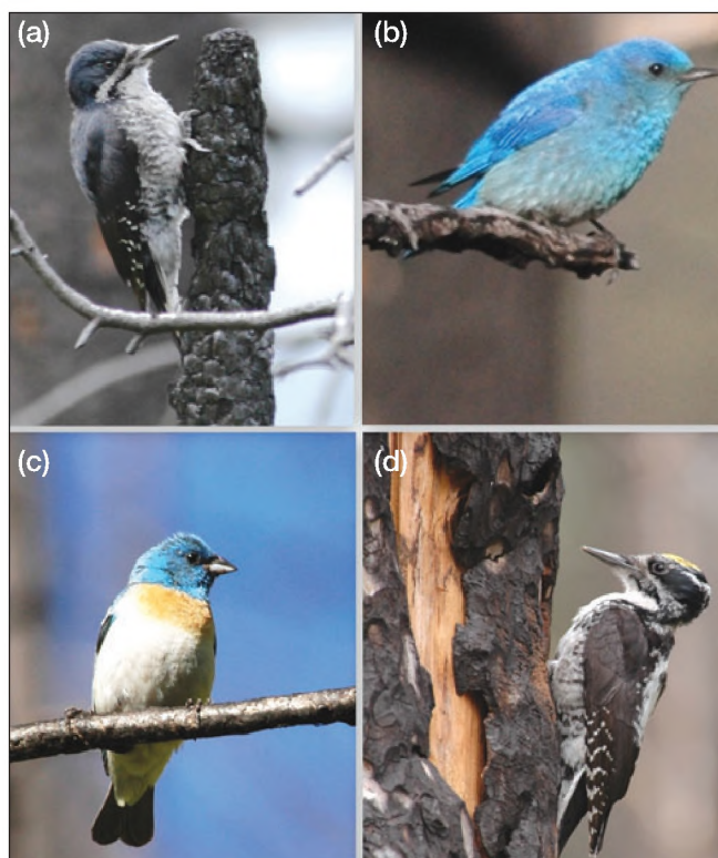
Figure 5. Bird diversity is typically high in early-successional communities on forest sites and includes many habitat specialists: (a) black-backed woodpeckers ( Picoides arcticus ) are almost entirely restricted to early post-fire habitat; (b) mountain bluebirds ( Sialia currucoides ) favor early-successional ecosystems; (c) lazuli buntings ( Passerina amoena ) and (d) three-toed woodpeckers ( Picoides tridactylus ) have similar requirements.

successional context (Minshall 2003; Figure 6). This greatly diversifies the types and timing of allochthonous inputs, as well as increases primary productivity. Allochthonous inputs are shifted from primarily tree-derived litter (coniferous-based in many systems) to material from a range of flowering herbs, shrubs, and trees, as well as from conifers. Consequently, litter inputs are highly variable in quality (eg decomposability) and delivery time, as compared with litter-fall contributed primarily by evergreen conifer species. Also, inputs to post-disturbance streams often include material with a high nitrogen content, such as litter from the early-successional genera Alnus and Ceanothus (Hibbs et al. 1994).