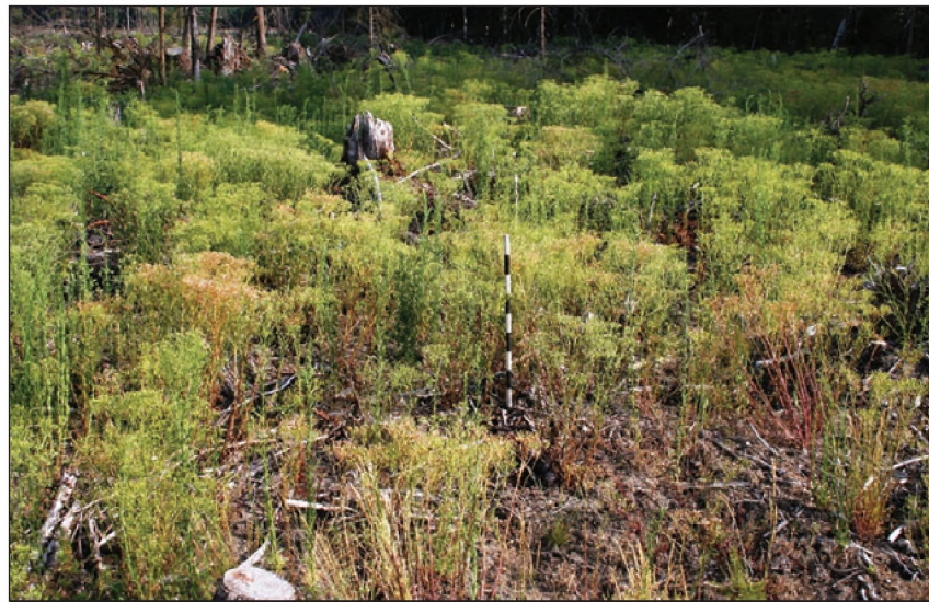
Figure 4. Early-successional communities are often dominated by annual herbaceous species for the first few years after disturbance; these are quickly displaced by perennial herbaceous species and shrubs.

Small mammal communities in ESFEs typically show high levels of diversity as well, including some obvious habitat specialists. The eastern chestnut mouse ( Pseudomys gracilicaudatus ), for example, inhabits early-successional environments in coastal eastern Australia for 2–5 years after a wildfire, and then declines dramatically until these environments are burned again (Fox 1990). Populations of mesopredators (medium-sized predators, such as raccoons [ Procyon lotor ] and fox species) benefit from the abundance of small vertebrate prey items characteristic of ESFEs. Likewise, some species