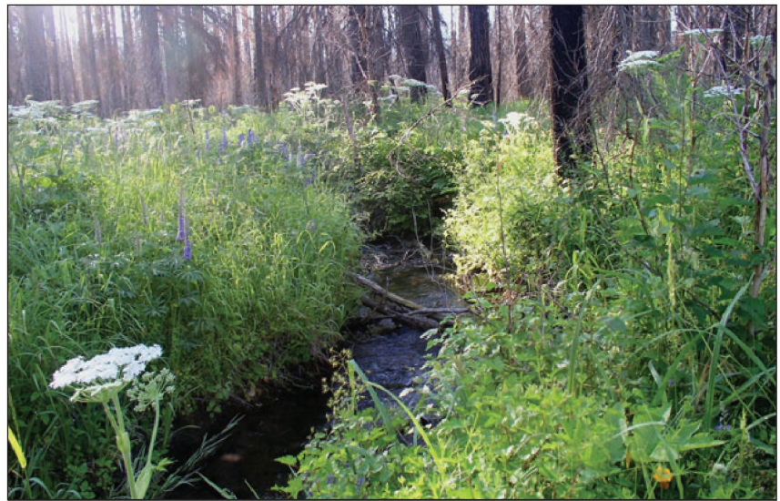
Figure 6. Streams within early-successional forest ecosystems contrast with forest-dominated reaches in many ecosystem attributes, including physical parameters (temperature and insolation), structure, plant and animal composition, and ecosystem processes, such as primary productivity.

Rates and patterns of geomorphic processes, such as erosion and nutrient leaching losses, are also different between ESFEs and later successional stages. Tree death results in a loss of root strength that is critical for stabilizing soils and deeper rock layers on mountain slopes (Perry et al. 2008). Erosion and landslides may occur at higher rates in ESFEs, contributing to the variability of sediment budgets in watersheds (Reeves et al. 1995) and creating long-lasting substrates for ruderals. While enhancing erosion processes, ESFEs also provide materials and processes that counteract this effect, such as woody debris, which retain sediments and organic materials, and surviving vegetation, which stabilizes slopes and nutrient stores (eg Bormann and Likens 1979).