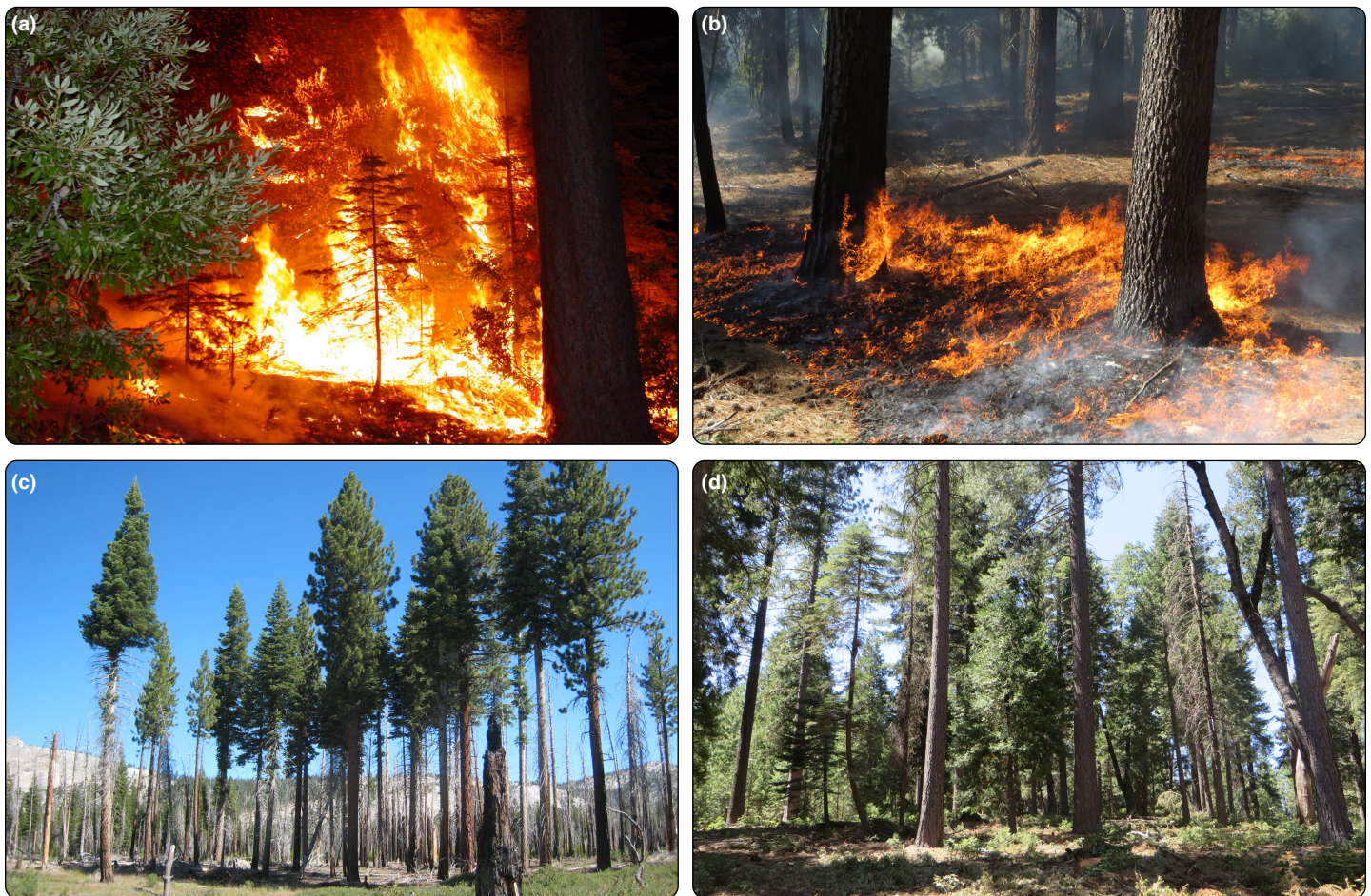
Figure 2. Fire and restoration thinning treatments in mixed-conifer forests in the Sierra Nevada, California. (a) First entry prescribed fire in 2002, with high forest density and small trees burning; (b) similar area in the same experiment illustrated in (a) after three prescribed fires (2002, 2009, and 2016) showing restored forest conditions (see Collins et al. [2014] for details on experiment); (c) wilderness site in Yosemite National Park that was burned by lightning-ignited wildfire and was managed for positive ecological objectives (Collins et al. 2009); and (d) multiple restoration thinning treatments (2001 and 2019) showing reduced tree density and surface fuels in the same experiment as depicted in (a) and (b).

topographically appropriate areas, and hardwoods (deciduous trees) and shrubs could minimize short-term effects on species of concern so that the long-term benefits of restored forest ecosystems are realized (Figure 3; Churchill et al. 2013; North et al. 2017).