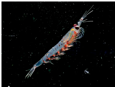
Krill are a key food source for seabirds and larger fish.