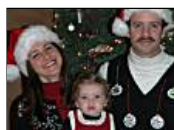
Ugly Holiday Sweater Jubilee!