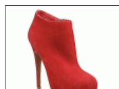
Show-stopping shoes of 2011