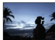
Apocalypse countdown begins