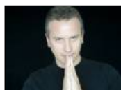
Dead men sell no heretical iPhones