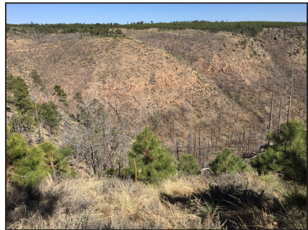
Figure 2. A severely burned area 14 years after the Rodeo-Chediski megafire, Arizona. Note that many snags remain standing within drainages, but in more exposed areas most snags have already fallen. As the remaining snags fall, large openings devoid of the elevated perches required by foraging owls will be created.

standing snags by 14 years post fire (Figure 2). Elsewhere in Arizona ponderosa pine ( Pinus ponderosa Laws) forests, 41% of snags fell within seven years following a wildfire (Chambers and Mast 2005), and coarse woody debris peaked between 6 yr and 12 yr post fire in two studies across chronosequences following wildfire (Passovoy and Fulé 2006, Roccaforte et al. 2012). This suggests that, at least in some areas or forest types, foraging habitat created by high-severity fire may be useful only for a short time. Ultimately, as snags fall, areas that are burned but not logged will provide the same low-quality foraging habitat reported by Bond (2016) for areas that are logged after fire. Note that salvage logging in spotted owl foraging habitat will hasten this process, however, and therefore still has negative consequences for spotted owl foraging habitat (Bond 2016).