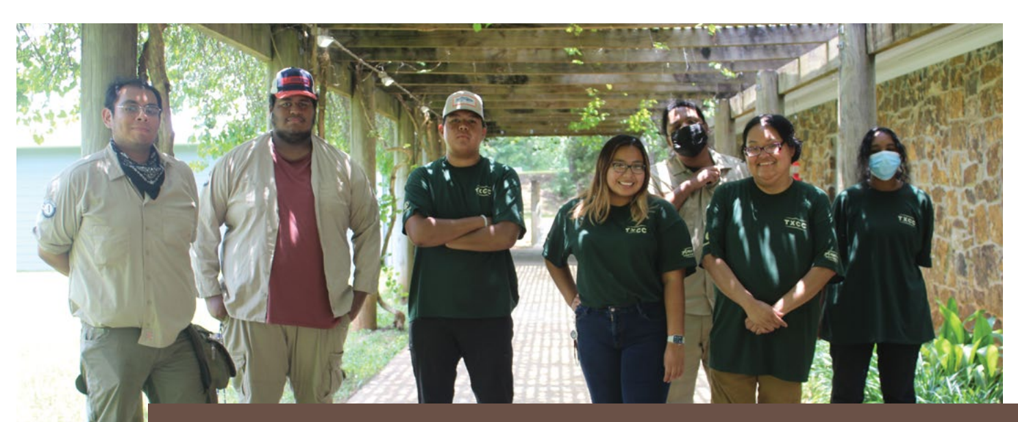
A Texas Conservation Corps crew completed natural resource projects on the Angelina and Sabine National Forests. The crew, which included members of the Alabama-Coushatta Tribe of Texas, focused on needs of both the local forests and Tribes; their work included recreation infrastructure maintenance, forest management, and wildlife habitat monitoring. The group also spent time with Forest Service partners to coordinate management projects.

5 This Action Plan is additionally responsive to, and builds on, the 2012 Report to the Secretary of Agriculture on USDA Policy and Procedures Review and Recommendations for Indian Sacred Sites, the Forest Service Research and Development Tribal Engagement Roadmap, and the USDA Forest Service Tribal Relations Strategic Plan for Fiscal Years 2019-2022.