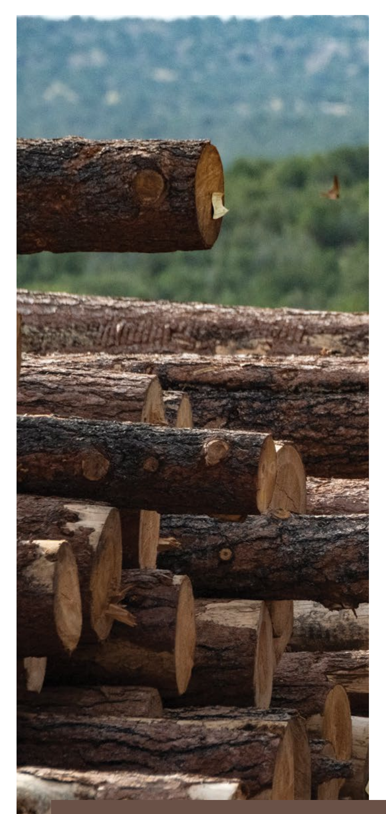
The Santa Fe National Forest and Pueblo of Jemez work together to find markets for small-diameter trees harvested for landscape restoration, such as these at the Walatowa Timber Industries mill.

The Forest Service is accountable in numerous ways to demonstrate success in Tribal relations, including actions and reporting that are responsive to the USDA