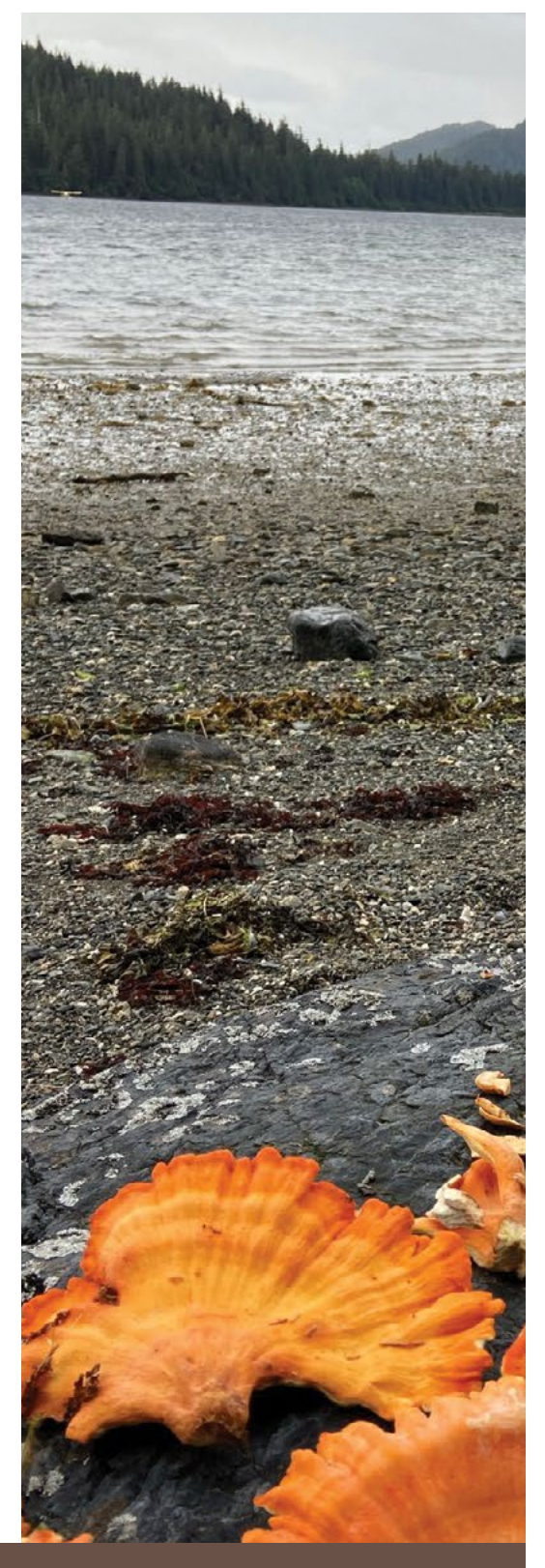
Chicken of the woods, an edible shelf fungus, ethically harvested in Kootznoowoo Wilderness, Admiralty Island National Monument, Tongass National Forest, AK.