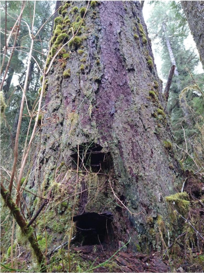
This was a dead snag , a perfect wildlife tree.