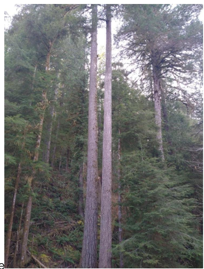
Insert Stand Photo ( Optional )