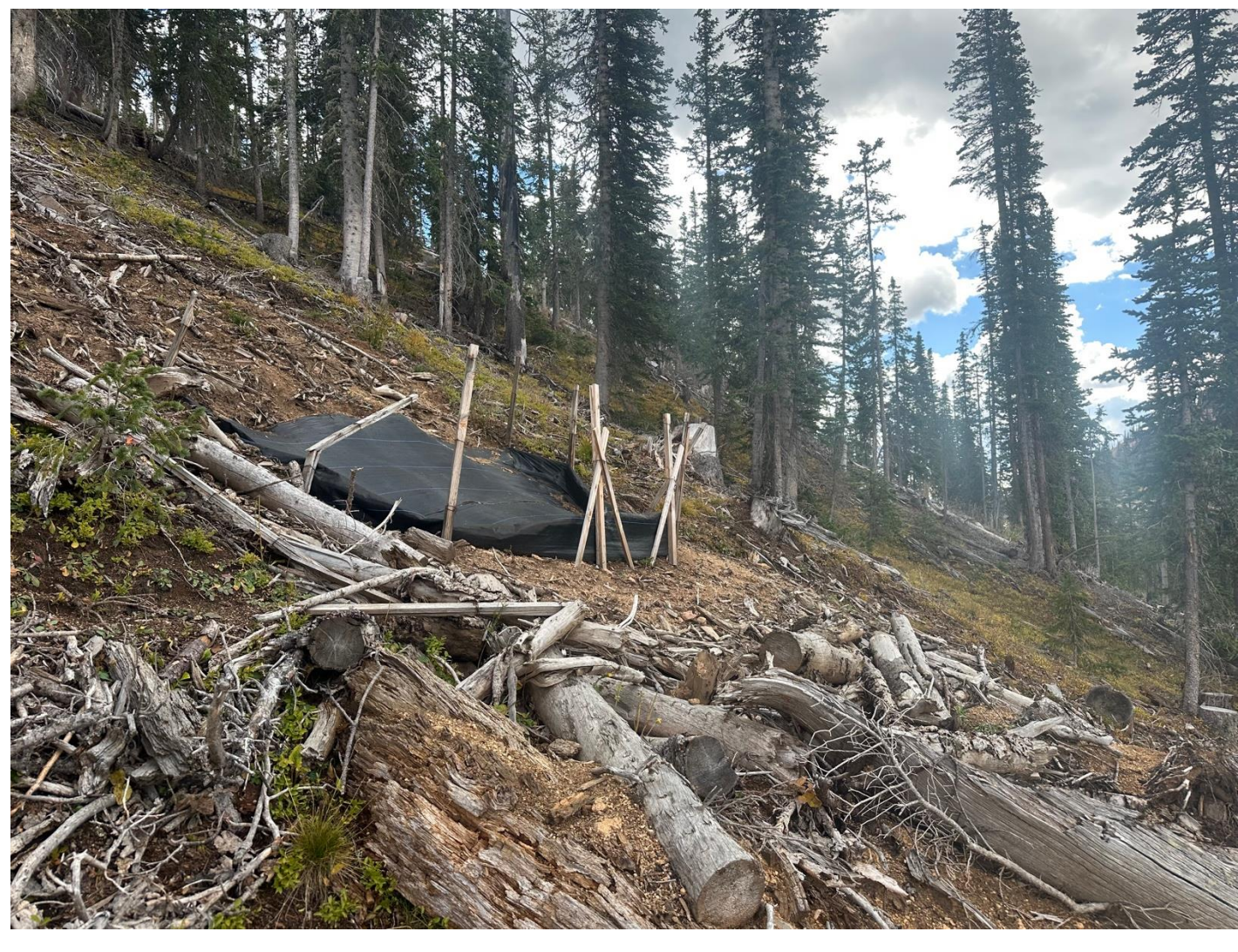
Another tarp and stake "mitigation" measure.