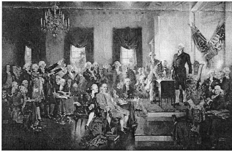
Image: Signing the Constitution by Howard Chandler Christy. Public domain.

In Washington Goes to War , David Brinkley details how the DC bureaucracy exploded during the war, aided in no small part by FDR's New Deal. Today, notwithstanding that the Constitution makes the federal government a republic and, in Article IV Section 4, guarantees that each of the 50 states is a republic, in all 51 jurisdictions, the republican form has been eclipsed by the administrative bureaucracy that dominates the federal and state governments.