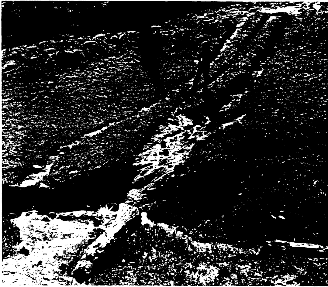
Figure 1-Trail problems and appropriate low-impact practices. (A) Meandering systems of user-created trails develop in popular destination areas. Avoid walking on either closed trails or developing user-created trails (practice 14). (B) Muddy trails that widen into quagmires and/or become systems of braided trails are a common problem. Important practices include avoiding trips where and when soils are wet and muddy (practice 4) and, if on a muddy trail, walking single file down the main tread (practice 15). (C) To reduce the likelihood of creating undesired user-created trails, cross-country hikers should spread out (practice 19). Hikers should not mark their route (practice 20) and should select a route that crosses durable surfaces (practice 21).