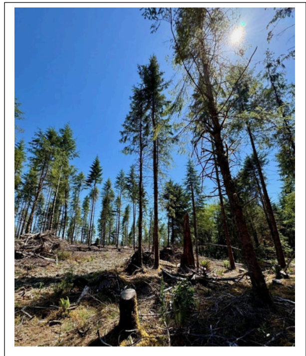
So-called Siuslaw “thinning”