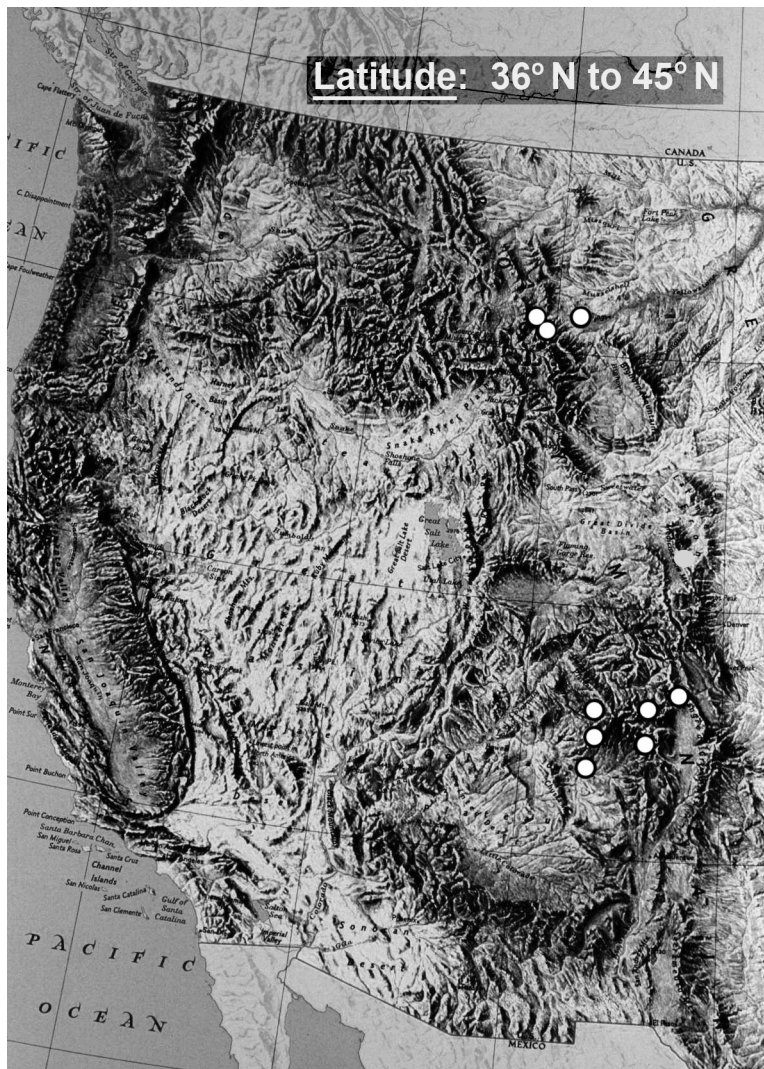
Fig. 1. Western USA. Rocky Mountain alpine collecting sites for macrofungi: Middle-Northern Floristic Zone = Beartooth Plateau (MT/WY), Southern Floristic Zone = Medicine Bow Mts (WY), Colorado Front Range, Sawatch Range and San Juan Mts (CO).