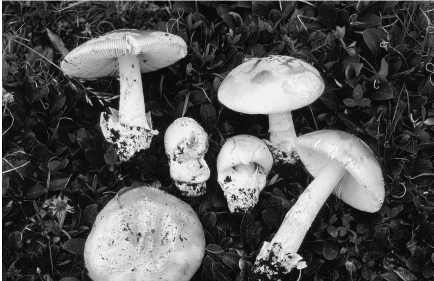
Fig. 3. Amanita absarokensis (sp.n., ad int). from the Beartooth Plateau in MT/WY, Rocky Mountains, USA. It is close to A. groenlandica but differs by a more salmon-colored pileus, velar tissue which does not gray on drying, a less viscid pileipellus and taller stature.

It appears close to A. groenlandica Bas ex Knudsen & T. Borgen (1987) from which it differs by a pale orange pileus and velar material that does not gray on drying. In aspect, it is also taller and less squat than A. groenlandica . Microscopic characteristics are similar to A. groenlandica with globose spores 9.5\text{--}11(12) \times 10\text{--}12(13) \mu\text{m} and filamentous velar tissue with some sphaerocysts present. It is significantly more robust than the arctic-alpine fungus A. nivalis .