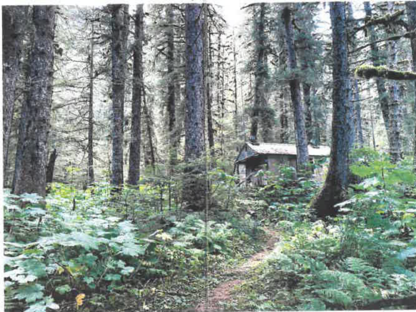
Our cabin on the Berners Summer 2023. My favorite place.