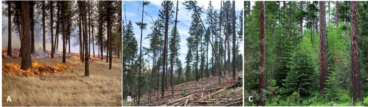
FIG. 2. Representative photos of (A) fuel reduction treatment (maintenance surface fire in a previously thinned and burned forest); (B) fuel rearrangement (forest residues following mechanical thinning); and (C) fuel accumulation (fire excluded forest with grand fir infilling around western larch trees).

severity can be amplified rather than diminished (Safford et al. 2009, Prichard et al. 2010). Furthermore, many fire-excluded forests have elevated surface fuels associated with more than a century of fire exclusion (Knapp et al. 2013, Keane et al. 2015). Effective treatment therefore necessitates prescribed burning that is intense enough to reduce surface and ladder fuels such that the likelihood of a subsequent intense fire is reduced (Stephens et al. 2012). Wildfires that result in substantial tree mortality may offer a short-term fuel reduction, but over longer time periods (15–25 yr), downed wood accumulations from snag and branch fall can elevate surface fuels and create conditions for high-intensity reburn events (Stevens-Rumann et al. 2012, Dunn and Bailey 2016, Johnson et al. 2020). As such, moderate to high-severity wildfires are generally considered a type of longer-term fuel rearrangement (Lydersen et al. 2019a).