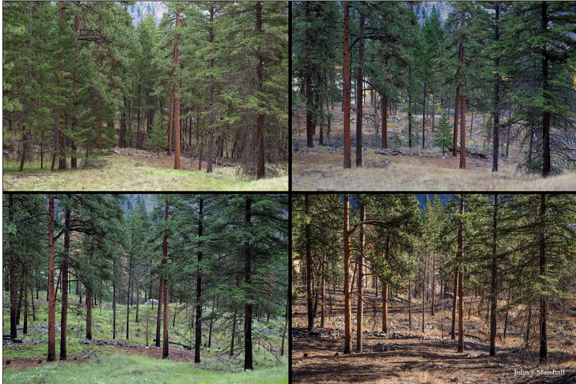
FIG. 3. Active forest restoration treatment, Sinlahekin Wildlife Refuge, Washington Department of Fish and Wildlife. Top left: multi-layered, dense dry mixed conifer forest after 100 yr of fire exclusion. Top right: residual forest after a variable density thinning treatment. Bottom right: treated condition after pile and broadcast burning. Bottom left: post-wildfire photo after the 2015 Lime Belt fire.