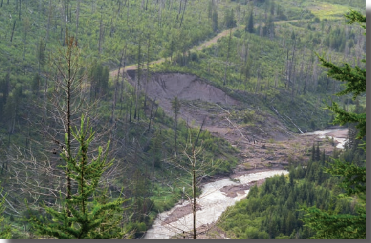
Water collecting in the ditch of this closed road contributed to mass failure into Sullivan Creek, a key bull trout spawning stream.

uses it instead for "timber support." [48] Though timber sales are supposed to then help maintain the roads used to haul the logs, a vicious downward spiral is set in motion as timber sales are used to justify more roads and roads are used to justify more timber sales! [49]