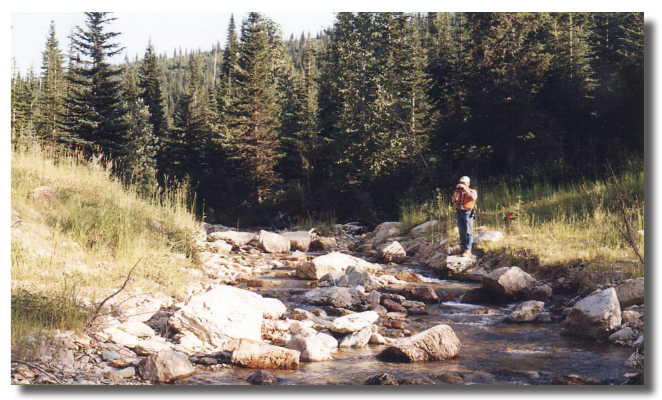
Reclamation of 60 miles of road in the Big Creek watershed removed culverts and restored native stream channels, like this reclaimed crossing. This resulted in Big Creek being the first watershed in Montana restored and removed from its list of watersheds "impaired" by logging and road-building.

This report will discuss how the Flathead tracks its roads and stream-crossing structures, discuss how it does and does not monitor them, and provide examples of the consequences when it fails to adequately manage them. It will conclude with recommendations on how to get the effort back on track rather than abandon it to the detriment of fish, wildlife and taxpayers.