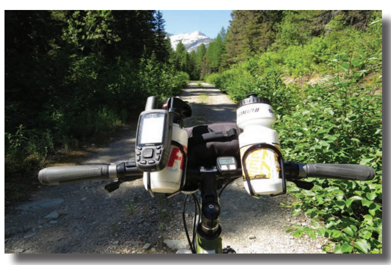
Monitoring culverts on closed roads is not an easy task, which is why it is best to remove them instead.

such monitoring plan! [2, 27] This even though it has bermed or simply abandoned several hundred roads to increase Security Core (and even more to lower TMRD). [28]