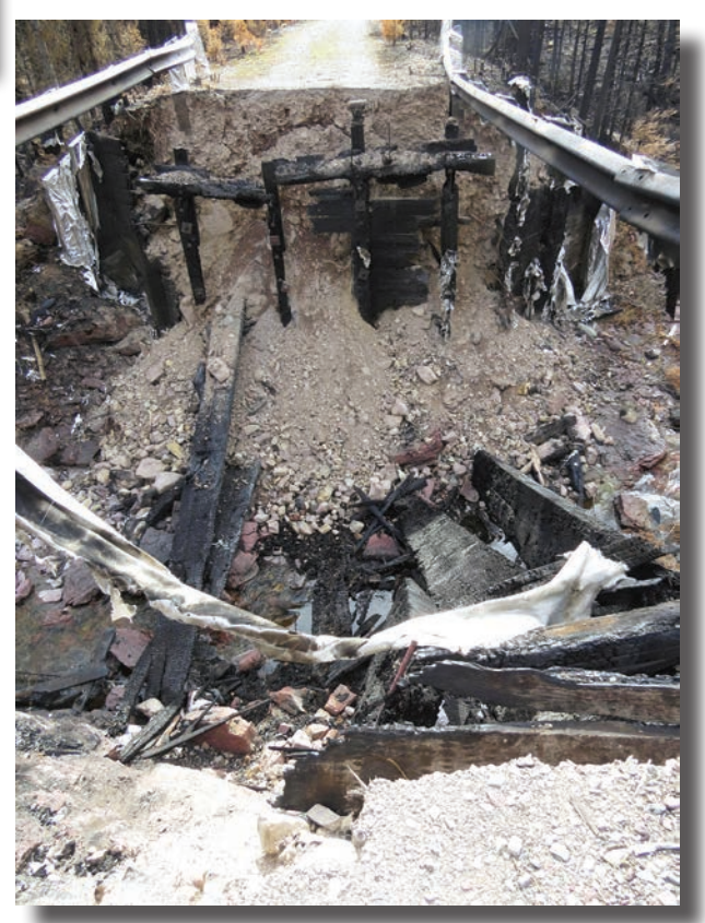
Wildfire burned this Road 549 bridge over Bunker Creek in 2015, stranding 3 bridges and 30 culverts beyond!

Shown on this page are just two of the problems we found behind the closure berm on Bunker Creek Road 549 the last two summers, in a bull trout watershed. [24]