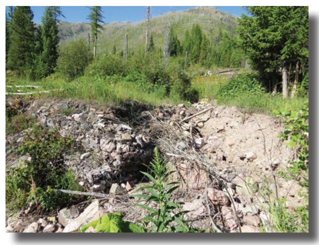
A blown-out culvert in the long-closed Bunker Creek Road 549 in 2014, upstream of bull trout critical habitat.