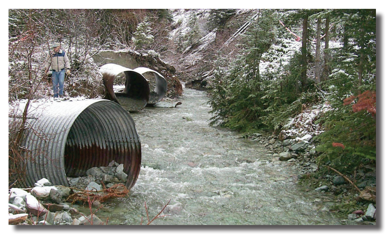
Easy-to-access culverts on open roads can blow out, like this one, while culverts on closed roads get inspected even less often. Though the Flathead National Forest has found up to half of its culverts on closed roads at high risk of failing, it has neither inspected them regularly nor removed them as promised. (Nokio Creek, 1999)

Swan View Coalition 3165 Foothill Road Kalispell, MT 59901 keith@swanview.org