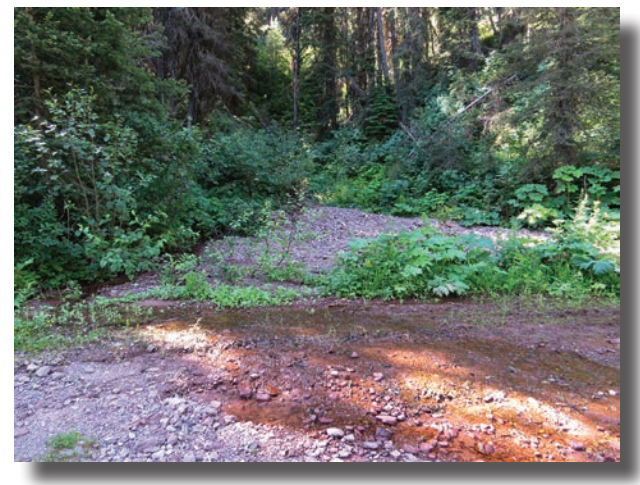
Road 1673 looking upstream at plugged catchment.

The author witnessed this same culvert plugged with bedload and failing in 1973