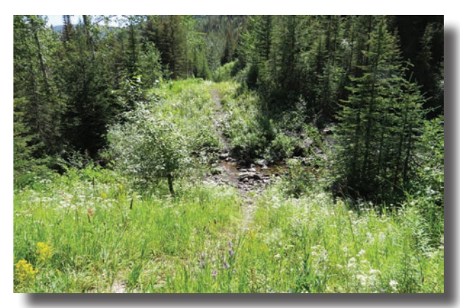
The last three miles of Bunker Creek Road 549 was decommissioned under Clinton's 1998 Clean Water Action Plan. Here a bridge was removed at Warrior Creek.

2. Recognize that A19 dovetails with requirements for managing roads in bull trout habitat and the agency's duty to arrive at an environmentally and fiscally sustainable "minimum road system."