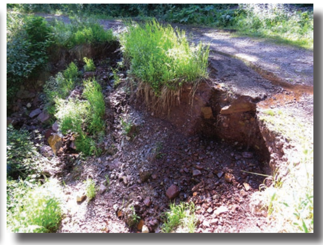
Road 1673 looking downstream at road-fill erosion.

As A19 was being written, Montana Department of Fish, Wildlife and Parks (MDF-WP) used a helicopter to survey culverts on closed roads in the South Fork Flathead and Spotted Bear area, finding 52 culverts par-