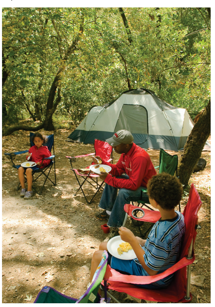
Enjoying a meal while camping at Bothe-Napa Valley State Park, CA.

Due to a variety of factors, the release of the 2021–2025 SCORP occurred in early 2022, as the Key Working Group convened to begin its work on the development of the Joint Strategy. As a result of this timing, representatives from the Key Working Group were able to meet with staff from the California Department of Parks and Recreation to discuss opportunities to recommend priorities and help to inform the vision of the 2026–2030 SCORP update, set to begin in 2023. During these discussions, it was acknowledged that the next update to the SCORP might be enhanced to capture the broadened scope and landscapes of outdoor recreation in California.