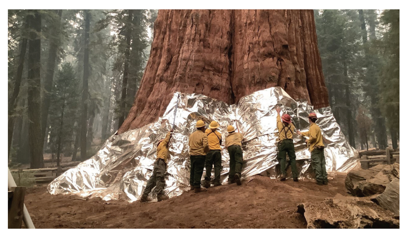
Firefighters and natural resource specialists apply a protective fire-shelter wrap to the General Sherman Tree in Sequoia National Park, CA, during the KNP Complex Fire in 2021.

The California Wildfire and Forest Resilience Task Force assigned Key Actions 3.13 and 3.14 of the Action Plan to the Sustainable Recreation/CALREC Vision Key Working Group (Key Working Group). Key Action 3.13 was completed by the Key Working Group through consultations with the California Department of Parks and Recreation (State Parks). Please see additional discussion of Key Action 3.13 on page 13. Key Action 3.14 is the more immediate subject of this Joint Strategy document.