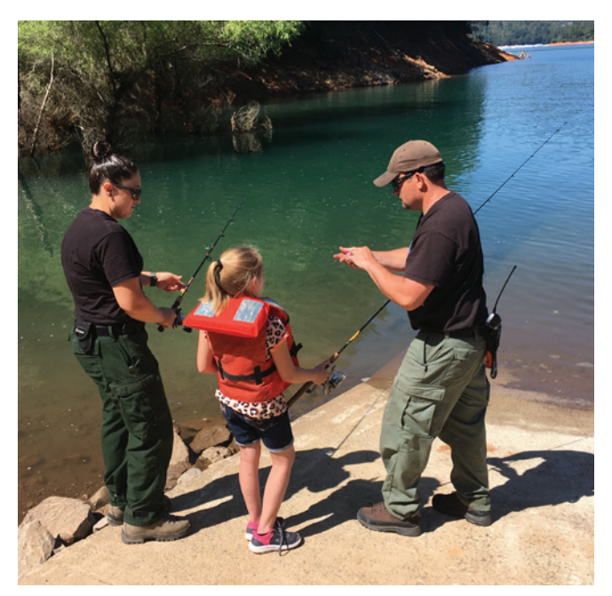
Fisheries and recreation employees teach local third-graders to fish on Kids Fishing Day at Shasta Lake, CA.

The following section describes the state and federal policies that authorized, inspired, and guided the creation of this Joint Strategy.