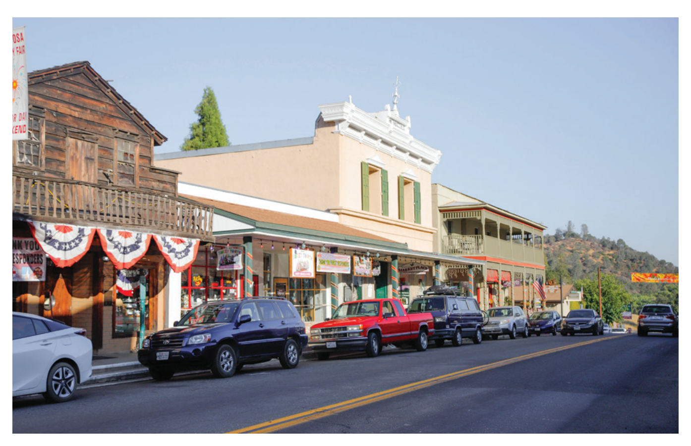
Downtown Mariposa, CA, in close proximity to Yosemite National Park.

Communities and their sustainable outdoor recreation economies enhance the physical, social, and economic vitality of California and, by nature of their dependence on public lands and waters, often play a critical role in ensuring that public lands and waters are maintained and resilient to climate change and wildfires. These communities are well positioned to provide safe, equitable, and inclusive access to outdoor recreation opportunities. Direct recreation spending, jobs, and tourism revenue contribute prominently to these forest and gateway communities. As has been increasingly demonstrated during the past decade, climate change and massive wildfires are having a devastating impact on our communities and their recreation economies. While wildfire risk reduction is key, more should be done to ensure that our recreation-based communities can respond and recover after wildfires and other natural disasters to support community resilience, economic vitality, and local jobs.