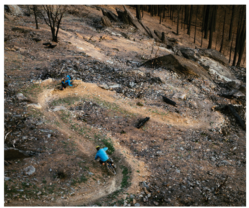
The Mount Hough Trail System, near Quincy, CA, before and after the Dixie Fire in 2021.

California has faced an unprecedented wildfire crisis during the past decade that has resulted in billions of dollars in damage to local economies and infrastructure, including outdoor recreation facilities and trail systems across California. Moreover, climate change has dramatically increased the length and intensity of California's fire seasons. The 2020 fire season broke records: Five of California's six largest fires in modern history burned at the same time. More than 4 million acres burned across the state, doubling the previous record. The following year, 2021, saw some of the most severe megafires in history, including the Dixie Fire, which became the largest single wildfire in state history and the first wildfire to burn across the width of the Sierra Nevada mountain range.