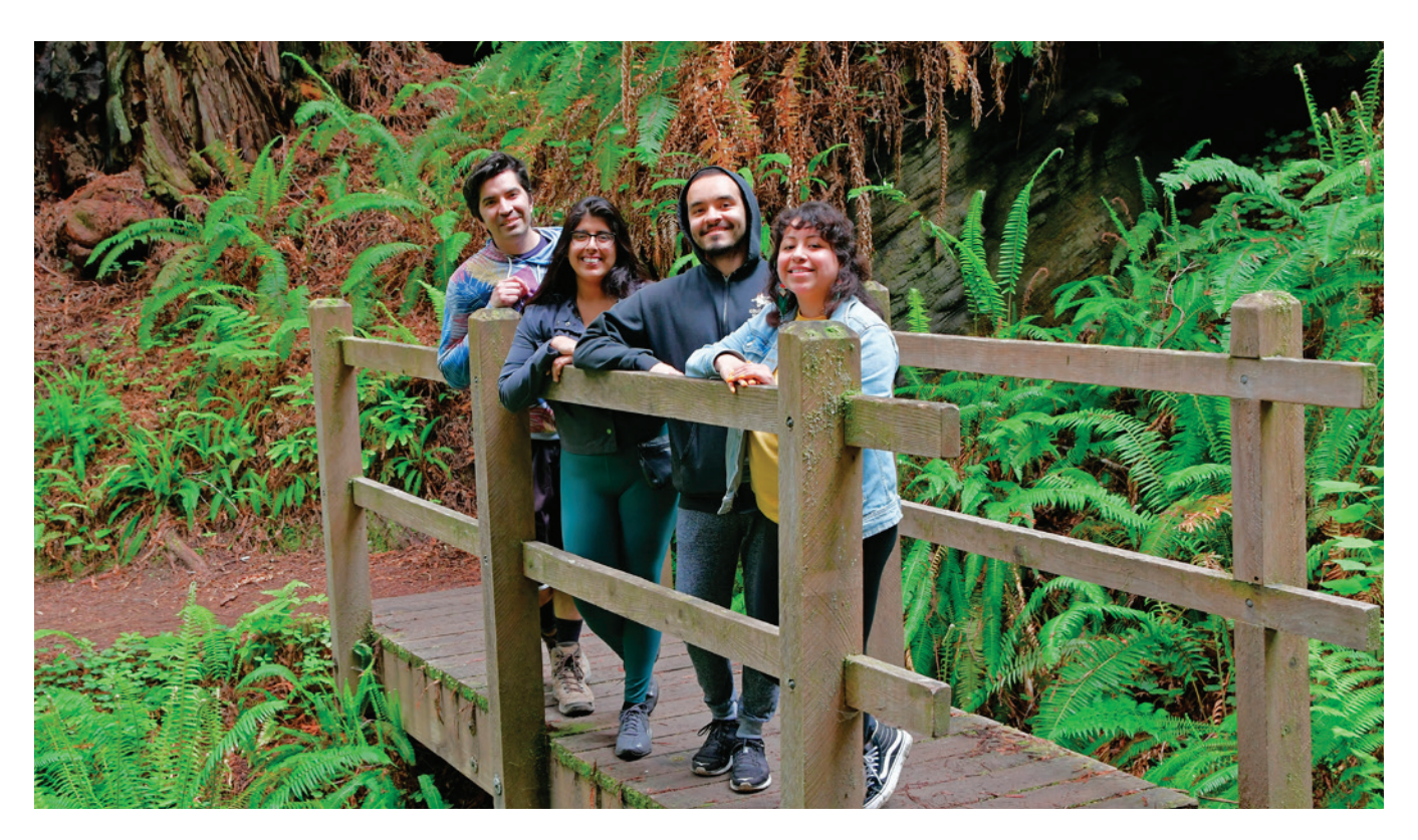
Posing on a bridge along the Trillium Falls Trail in Redwood National and State Parks, CA.

California and its partners must build upon and expand an inclusionary culture of sustainable outdoor recreation, promoting equitable access across California's public lands and waters that reflects the diversity of all peoples and the legacy of our Native American history, culture, and use. Inspired by the California Natural Resources Agency's Outdoors for All initiative, our work will strive to address long-standing environmental, social, and economic inequities in our society that have resulted in physical and societal barriers to outdoor recreation access for underserved and underrepresented residents. Improvements to outdoor recreation access, including planning, programming, and infrastructure, will be co-created with communities, forest health, and wildfire response partners and designed around community values to be resilient to increasingly frequent wildfires and natural disasters. Advancing equitable access will require a high level of engagement with underserved and underrepresented populations to prioritize and implement integrated outdoor recreation access and wildfire risk reduction, resiliency, and recovery actions that provide respite for these communities year-round and especially during times of disaster.