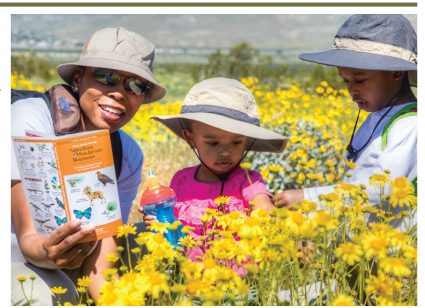
Admiring wildflowers along California's Pacific Crest National Scenic Trail.