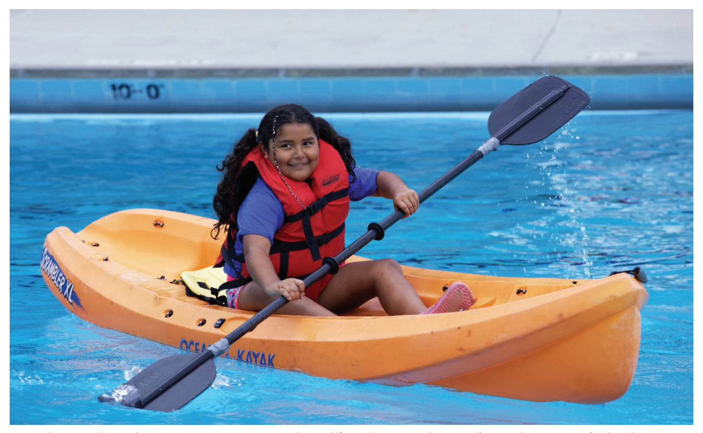
Kayaking in an indoor pool can serve as a recreation opportunity during wildfire smoke events.

4. Increase Opportunities for Indoor Recreation: Develop public, multi-use indoor recreation spaces that can offer recreation when smoke and wildfire affect the safety of outdoor recreation. These spaces can also be used as information hubs, libraries, cooling centers, Local Assistance Centers, shelters, or staging areas during emergencies.