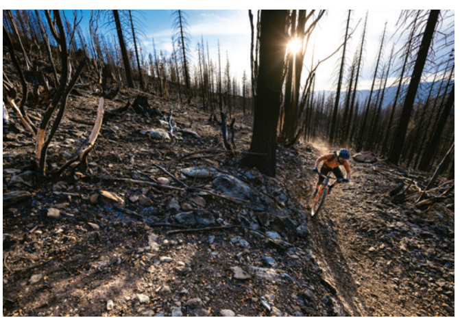
Mountain biking before and after the Dixie Fire in 2021, near Quincy, CA.

The purpose of this Joint Strategy is to provide the California Wildfire and Forest Resilience Task Force with a road map for how to protect and improve sustainable outdoor recreation assets and access in the context of wildfire and natural disaster planning and response. The audience of this Joint Strategy includes the U.S. Forest Service (USFS), the state of California, land managers, and the extended outdoor recreation community. This Joint Strategy emphasizes the fact that sustainable outdoor recreation opportunities must be high-quality and resilient to meet the needs of a diverse and growing population and changing climate.