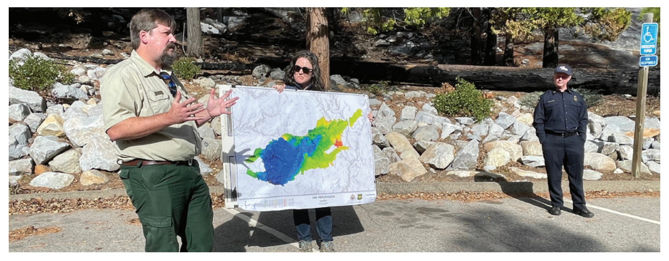
Leadership from the U.S. Forest Service, Sierra Nevada Conservancy, and CAL FIRE discuss the effect of vegetation treatment on burn severity during the Caldor Fire in 2021.