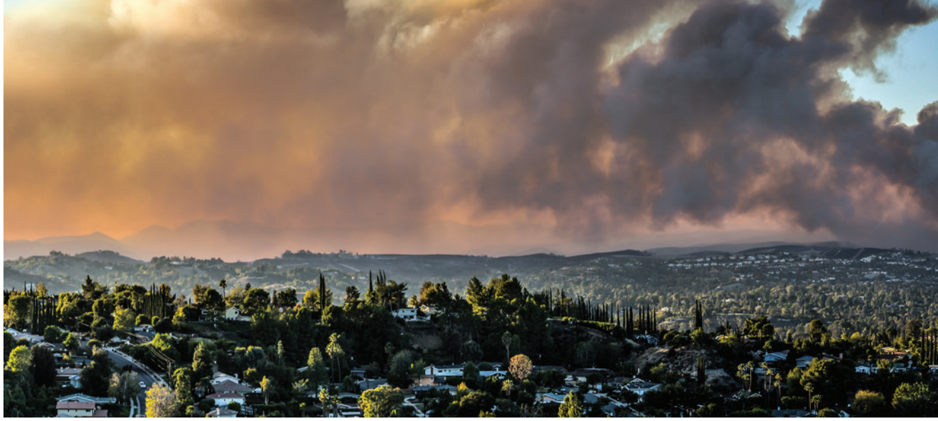
Smoke from the Woolsey Fire in 2018, seen from Topanga, CA.

1. Improve Air Quality Advisory Communication: Refine existing air quality communication tools, such as the California Smoke Spotter Application (app) and EPA AirNow, so that more users are aware of the tools, information is available in multiple languages, and users are advised of preventative measures to reduce their exposure. Focus the awareness campaign and information on those who are more likely to be exposed to air quality impacts including smoke, such as outdoor recreation workers.