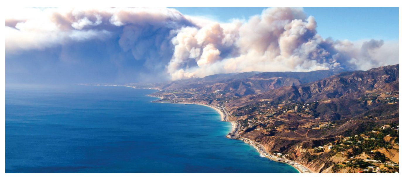
The Woolsey Fire burns near the coast in 2018 in Los Angeles and Ventura counties, prompting smoke advisories in Los Angeles, Ventura, Orange, Riverside, and San Bernardino counties.