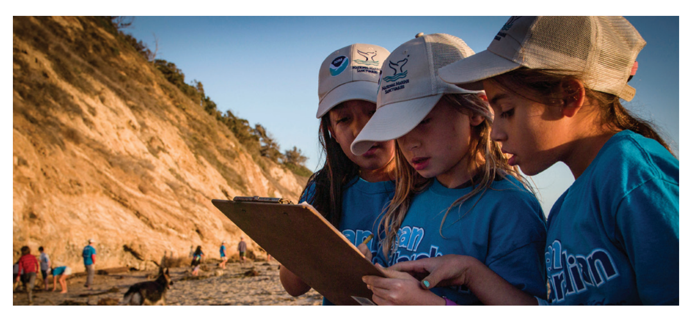
Children record observations on a clipboard at California's Channel Islands National Marine Sanctuary as part of the Ocean Guardian program.

The Key Working Group developed the Joint Strategy for Sustainable Outdoor Recreation and Wildfire Resilience (Joint Strategy) to provide a road map for improved access to sustainable outdoor recreation in an era when wildfires are having tremendous impacts on outdoor recreation opportunities throughout California. The Joint Strategy recognizes that our recreation system exists within a vast network of watersheds that stretches all the way from the headwaters in the mountains to the Pacific Ocean. Our recreation system is affected by wildfires and natural disasters in profound ways both upstream and downstream from where people recreate. The Key Working Group consisted of staff from federal and state agencies, regional and local agencies, industry, and nongovernmental organizations. The Mammoth Lakes Trails and Public Access Foundation (MLTPA) convened the Key Working Group. The Consensus and Collaboration Program of the College of Continuing Education at Sacramento State University provided facilitation. Climate Equity Solutions Inc. contributed drafting and editing services, under contract to MLTPA.