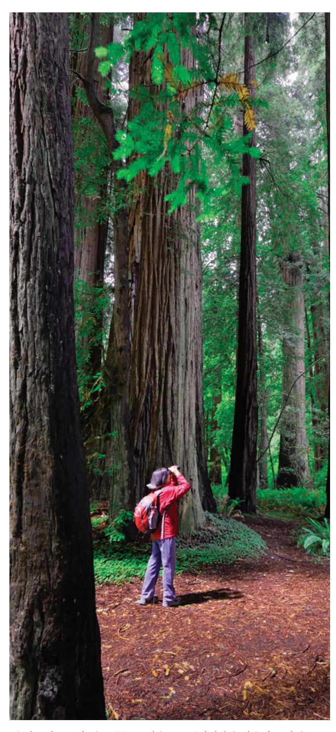
Birdwatching at the Stout Memorial Grove in Jedediah Smith Redwoods State Park, CA.

California is home to some of the most beautiful and celebrated landscapes on Earth. More than 100 Native American tribes have stewarded and protected California's lands and waters from time immemorial through the present day. Often, places valued as recreation sites today hold significant cultural and ecological importance for Indigenous peoples. Acknowledging California as the homeland of Native American tribes is just a small step to take in the spirit of truth and healing. This Joint Strategy attempts to elevate California Native governments, communities, peoples, and priorities into the collective thinking about sustainable outdoor recreation, inclusive access to the outdoors, and wildfire resilience. Realizing the privilege of those who recreate outside, this Joint Strategy hopes to contribute to further discussions of appropriate and respectful public access to valued and significant places.