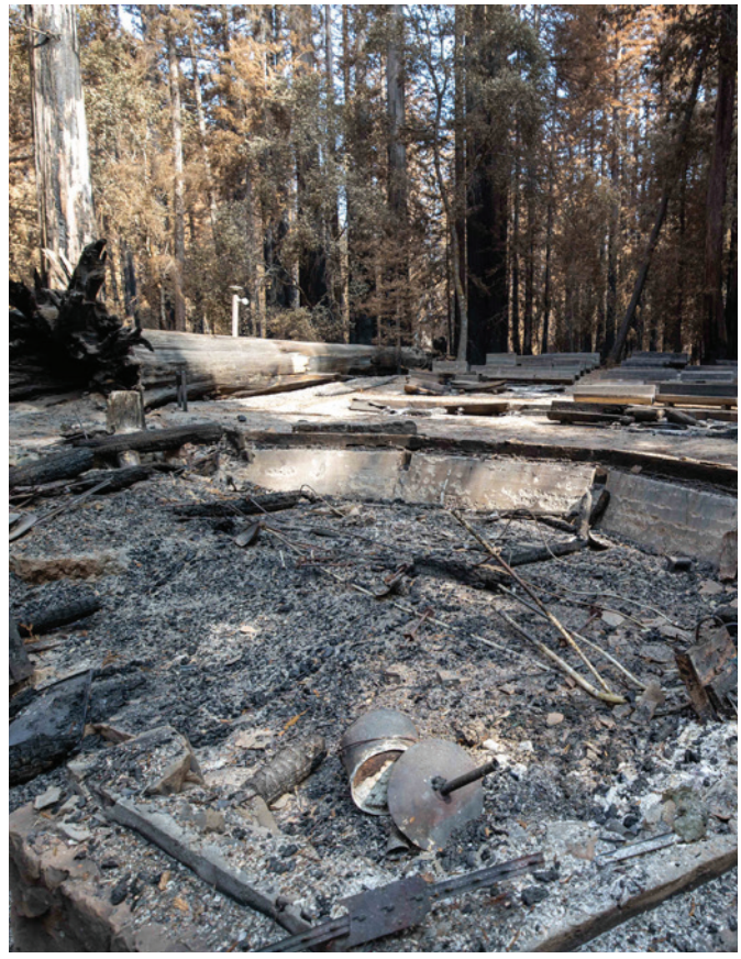
Before and after photos of an outdoor amphitheater at California's Big Basin Redwoods State Park, which burned during the CZU Complex Fire in 2020.