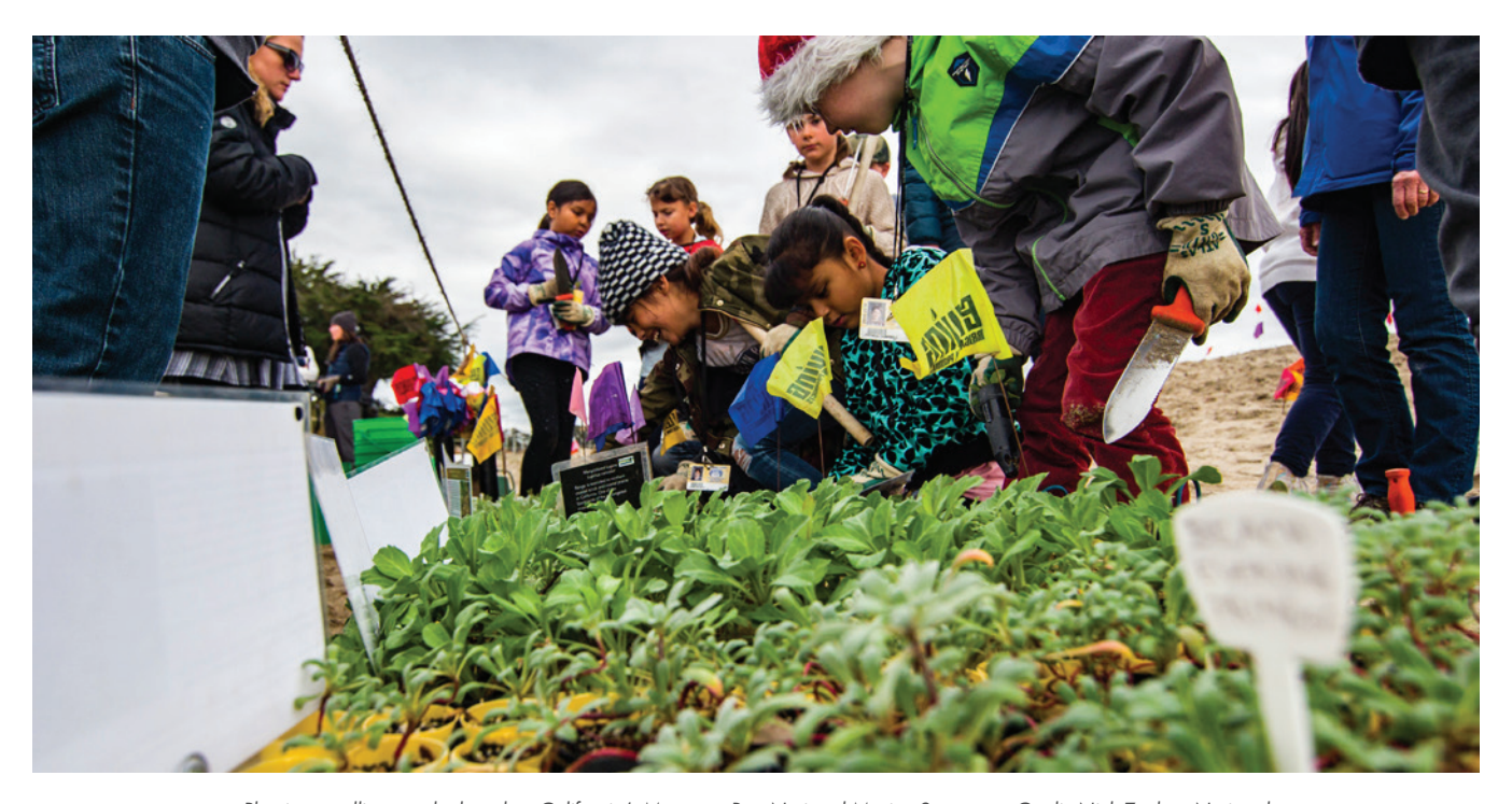
Planting seedlings on the beach at California's Monterey Bay National Marine Sanctuary.