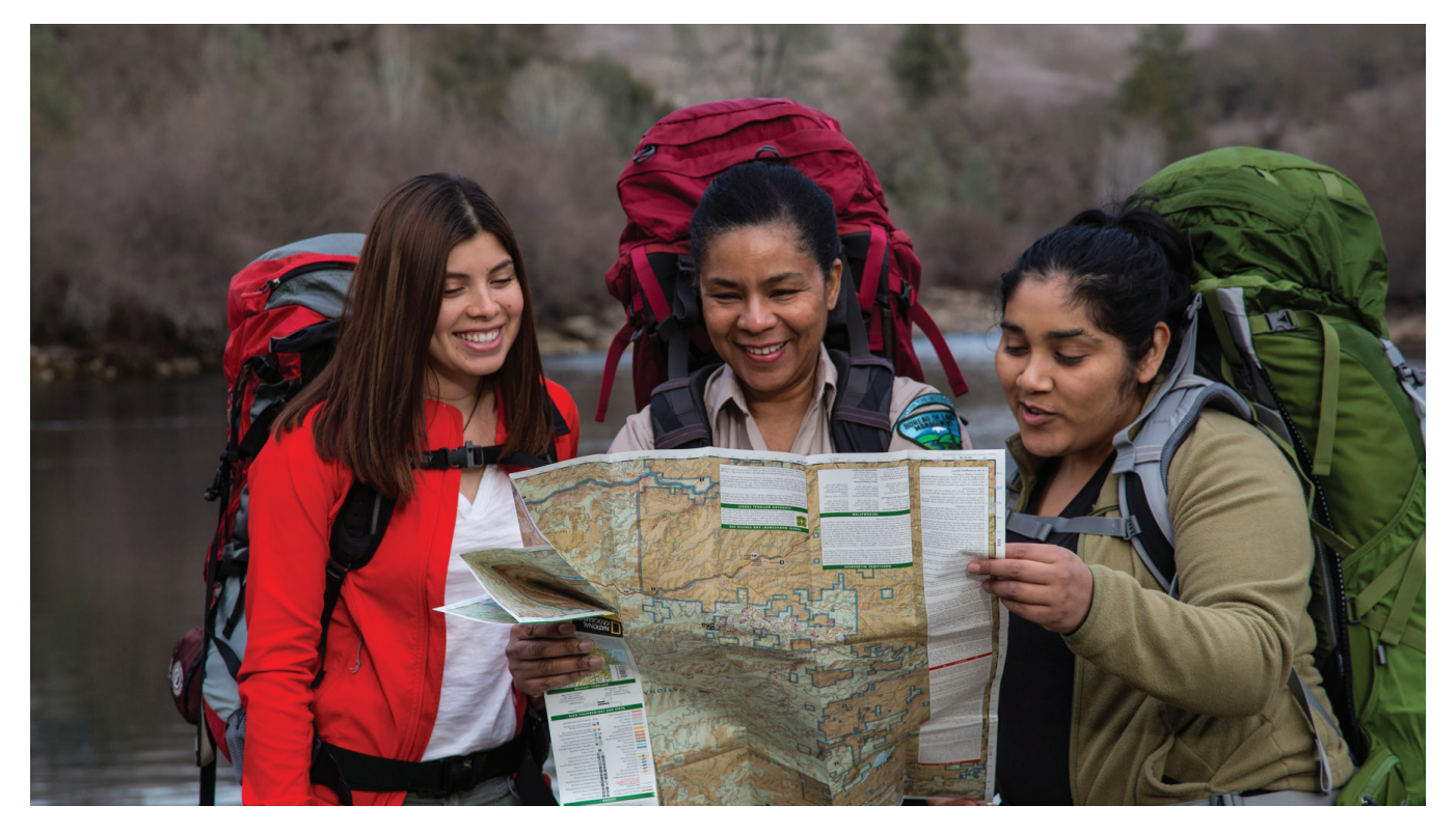
Two backpackers and a ranger look at a map at Cronan Ranch Regional Trails Park in Pilot Hill, CA.

The following guiding principles provide a foundation for all of the Goals and Key Actions of the Joint Strategy, ensuring that the Joint Strategy is achieved broadly and equitably across California.