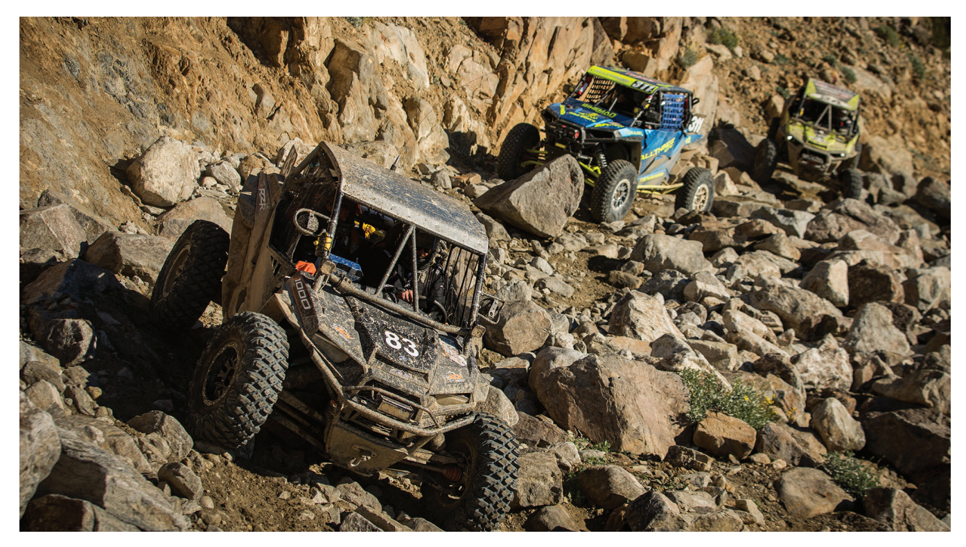
UTVs compete at the King of Hammers event in California's Johnson Valley OHV Area. ATVing and recreational motorcycling generated $8 billion in GDP nationally in 2021, according to the Bureau of Economic Analysis.