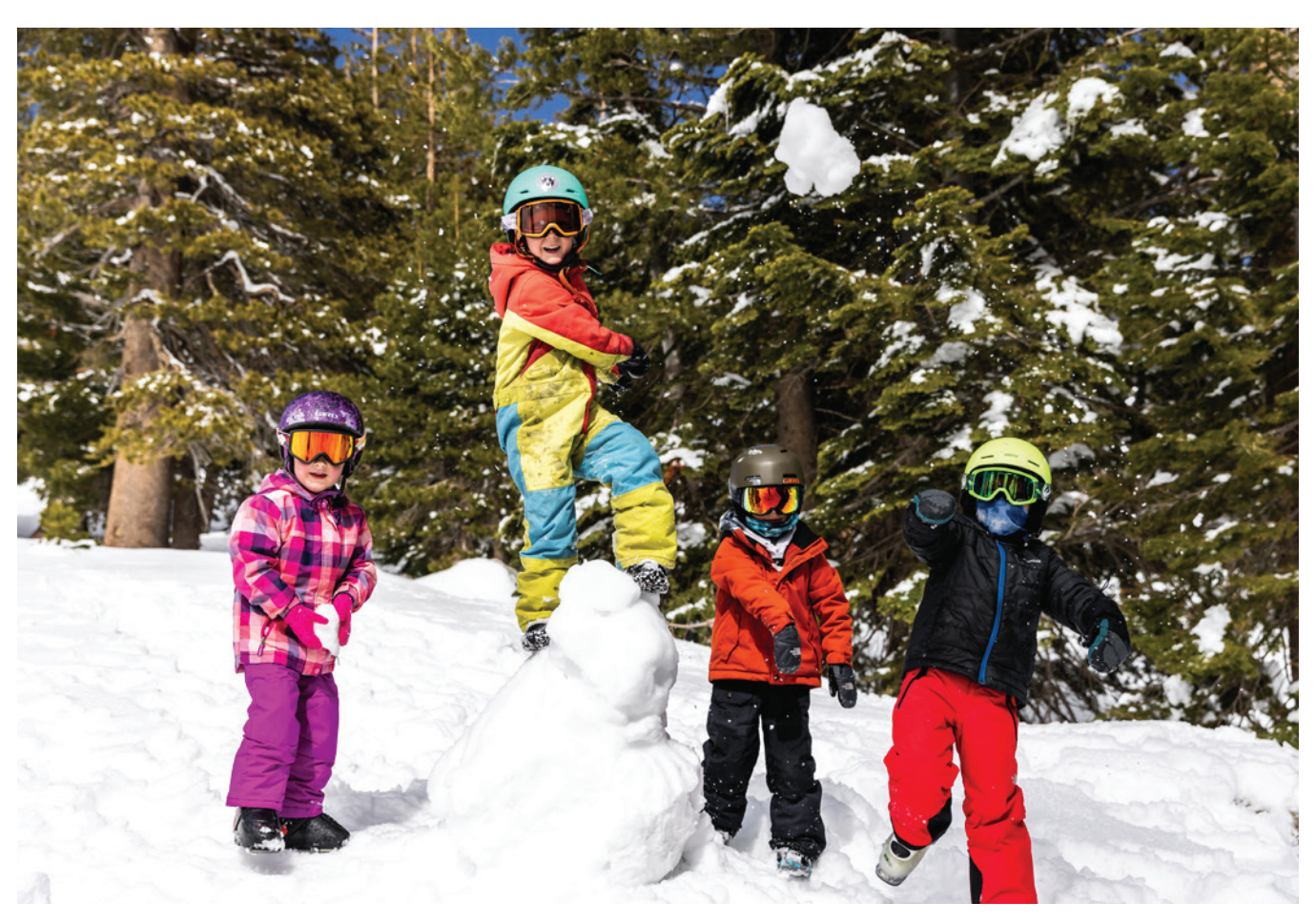
Children play in the snow near California's Sierra-at-Tahoe.

California and its partners are committed to providing outdoor recreation opportunities that nurture the mental, physical, spiritual, and emotional health and safety of all people while protecting our natural resources. Wildfires and other natural disasters can impede access to outdoor recreation at a time when people need it most for their well-being. To address this need for outdoor recreation opportunities before, during, and after natural disasters, we will communicate proactively with residents and visitors to promote the healthy enjoyment of outdoor recreation, inform people of where facilities are available, and apprise people of how to avoid smoke exposure and other risk factors. We will prioritize the development of resilient recreation opportunities that can function as alternative sites when other facilities are closed or inaccessible. The development of safe places to recreate is vitally important in ensuring safe access for all.