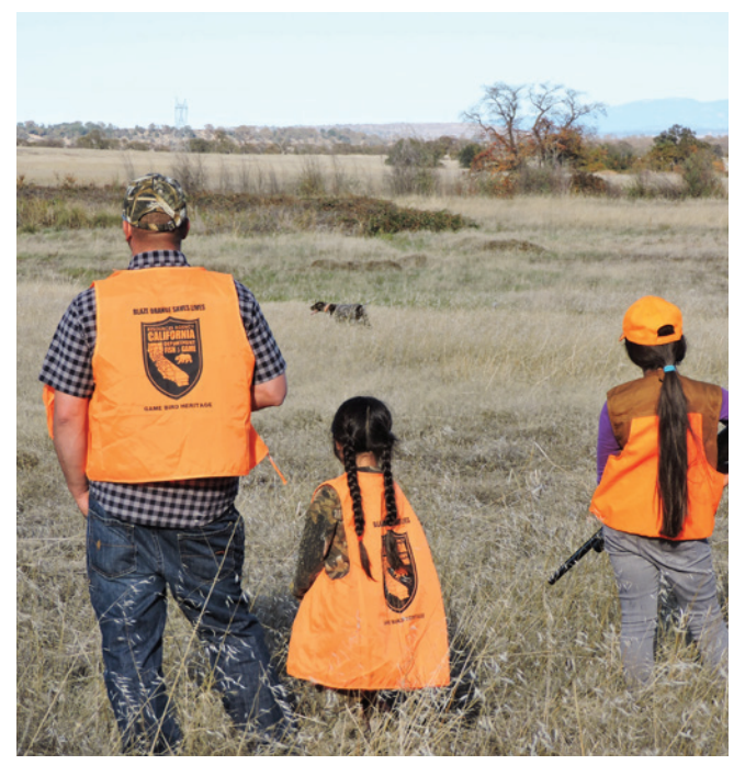
The Annual Pheasant Hunt at the Sacramento River Bend Outstanding Natural Area, CA, where youth and women can learn safe hunting techniques and traditional practices.