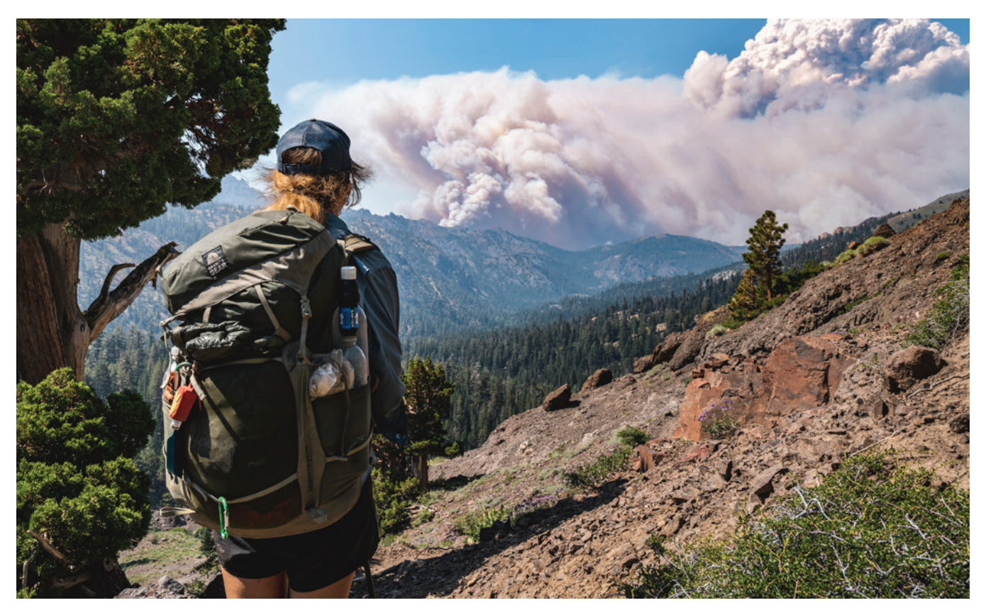
A hiker looks at smoke from the 2021 Caldor Fire in the distance.

Our aim is to promote forest health and resiliency alongside sustainable outdoor recreation for all throughout California. We recognize that forest health and outdoor recreation mutually depend on one another and that our management of them needs to be integrated. This goal promotes public access and enjoyment of our forests and public lands and all the benefits that come with that while at the same time addressing the impacts and mitigating factors of outdoor recreation from catastrophic wildfires and climate effects. By ensuring healthy lands and waters, outdoor recreation users feel connected to nature in places and communities that are socially, economically, and environmentally rich and resilient.