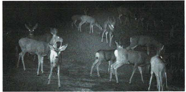
P. Cramer, USU, UDWR, and UDOT

The new fencing and wildlife crossings begin where the