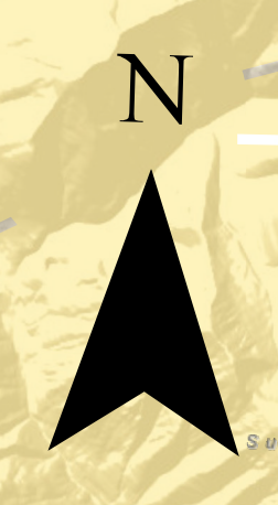
EXHIBIT C SHOWING SUITABLE TIMBER GREATER THAN 40% SLOPES AND FENS/POTENTIAL FENS