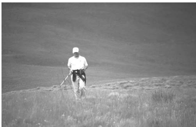
Figure 3 —Radio-tracking sage-grouse in high-elevation summer range with a stand of mountain big sagebrush in the background.

Fall (late September into early December) is a time of change for sage-grouse from being in groups of hens with chicks or males and unsuccessful brood hens to separation