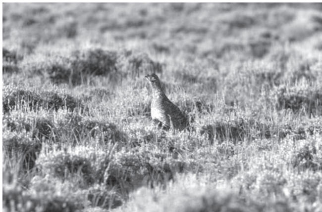
Figure 2 —Sage-grouse brood hen in good quality Wyoming big sagebrush habitat, North Park, Colorado (photograph by C. E. Braun).

adequate forage, especially succulent forbs, and cover useful for escape. These habitats may include those used for agriculture, especially for native and cultivated hay production, edges of bean and potato fields, as well as more typical sagebrush uplands and moist drainages. Taller (>40 cm) and robust (10 to 25 percent canopy cover) sagebrush is needed for loafing and escape cover as well as a source of food. Grass and forb ground cover can exceed 60 percent (hayfields). Provided moisture is available through water catchments or from succulent foliage, sage-grouse may be widely dispersed over a variety of habitats during this period (Connelly and others 2000a). As late summer approaches, there is movement from lower sites to benches and ridges (fig. 3) where sage-grouse forage extensively on leaves of sagebrush.