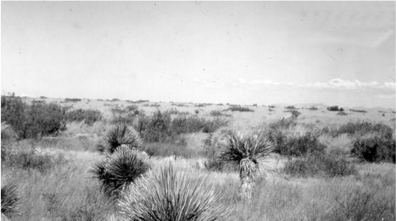
Fig. 4. A long term conservatively grazed pasture on the Chihuahuan Desert Rangeland Research Center in southcentral New Mexico.

of the proper level with some destocking under severe drought would yield the most income with the least risk. A relatively constant stocking rate that would use about 35% of the forage in an average year was considered the best approach.