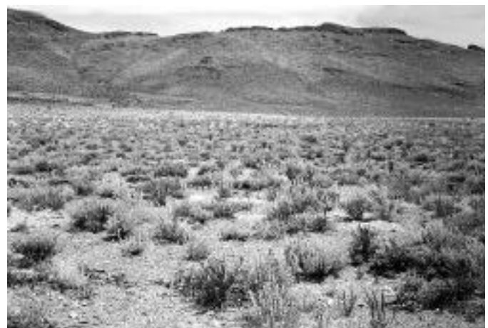
Fig. 2. A winterfat plant community under long term moderate grazing on the Desert Experimental Range in southwestern Utah (photo courtesy of Dr. Phil Ogden).