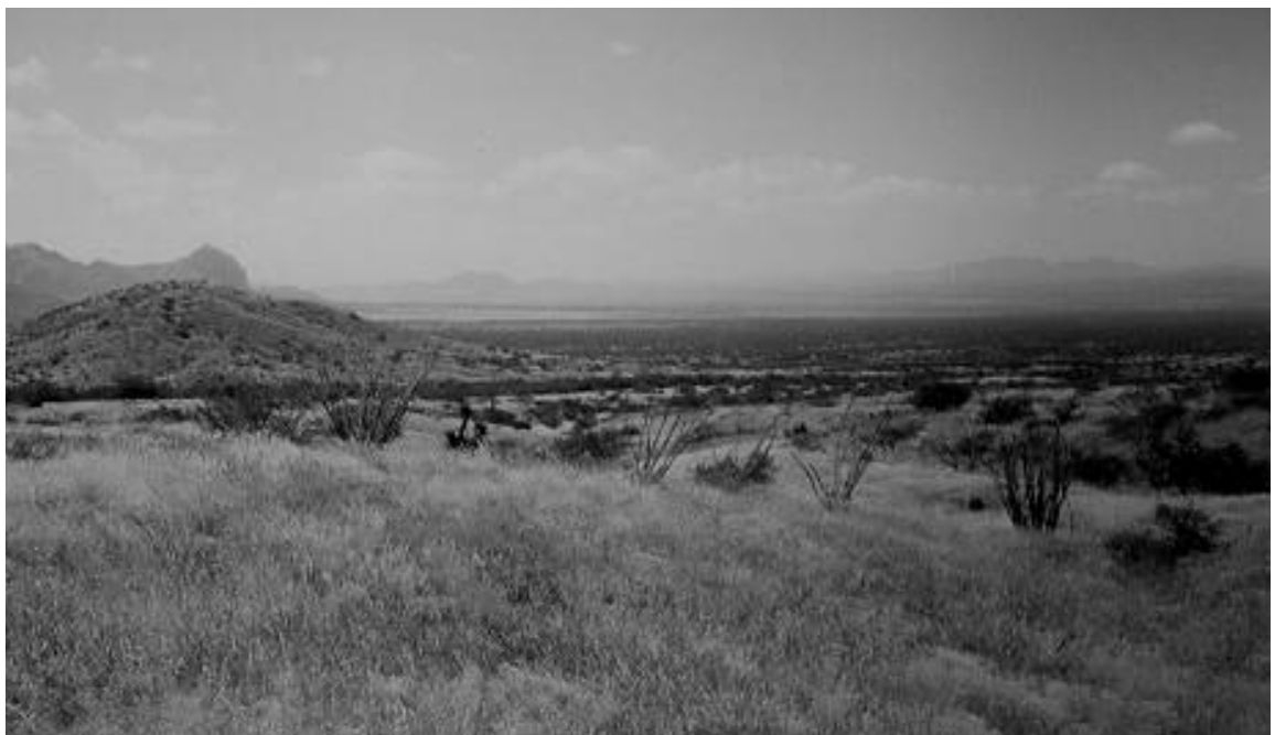
Fig. 3. A long term moderately grazed pasture on the Santa Rita Experimental Range in southcentral Arizona.

The primary study evaluating grazing management on the Santa Rita Range involved 2 blocks with 3 pastures that were assigned to year-long, summer-fall, or winter-spring grazing by cow-calf herds. Over the 10 year study period (1957 - 1967), Martin and Cable reported that perennial grass cover and yield showed a strong decreasing relationship to increasing forage use. At the same time burroweed, an undesirable species, was positively associated with increasing forage use. Year-long pastures received lower forage use than those grazed seasonally. They, in turn, had higher perennial grass cover. Herbage yields on year-long pastures showed more increase than on seasonally grazed pastures. The authors concluded the consistency with which higher perennial grass