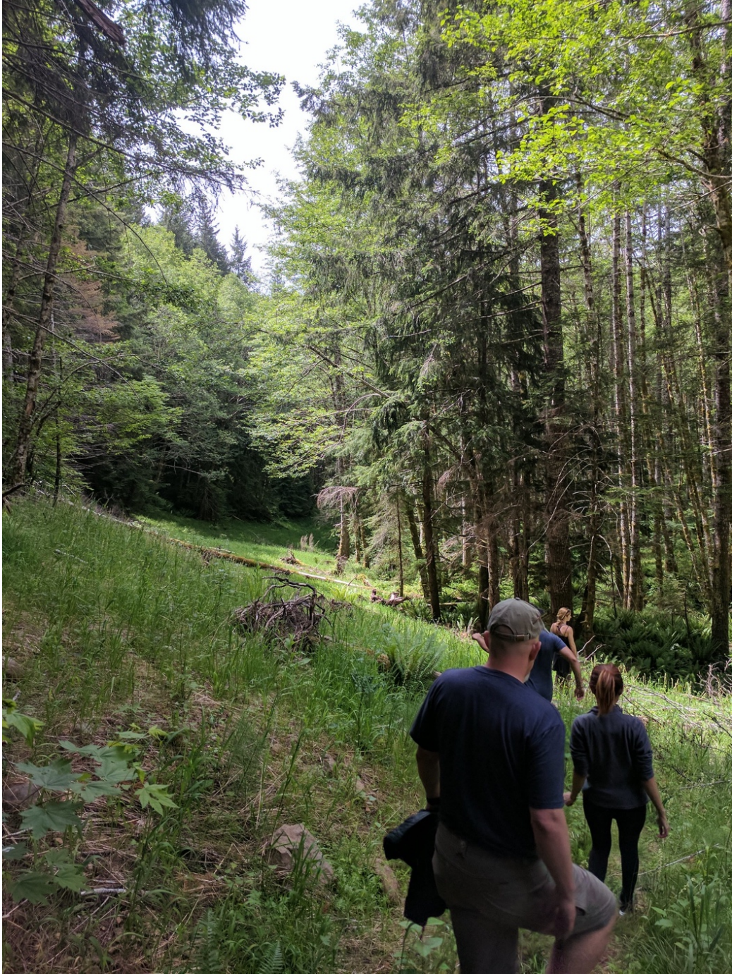
Recontoured road, Olympic National Forest - Skokomish Watershed, 2017.