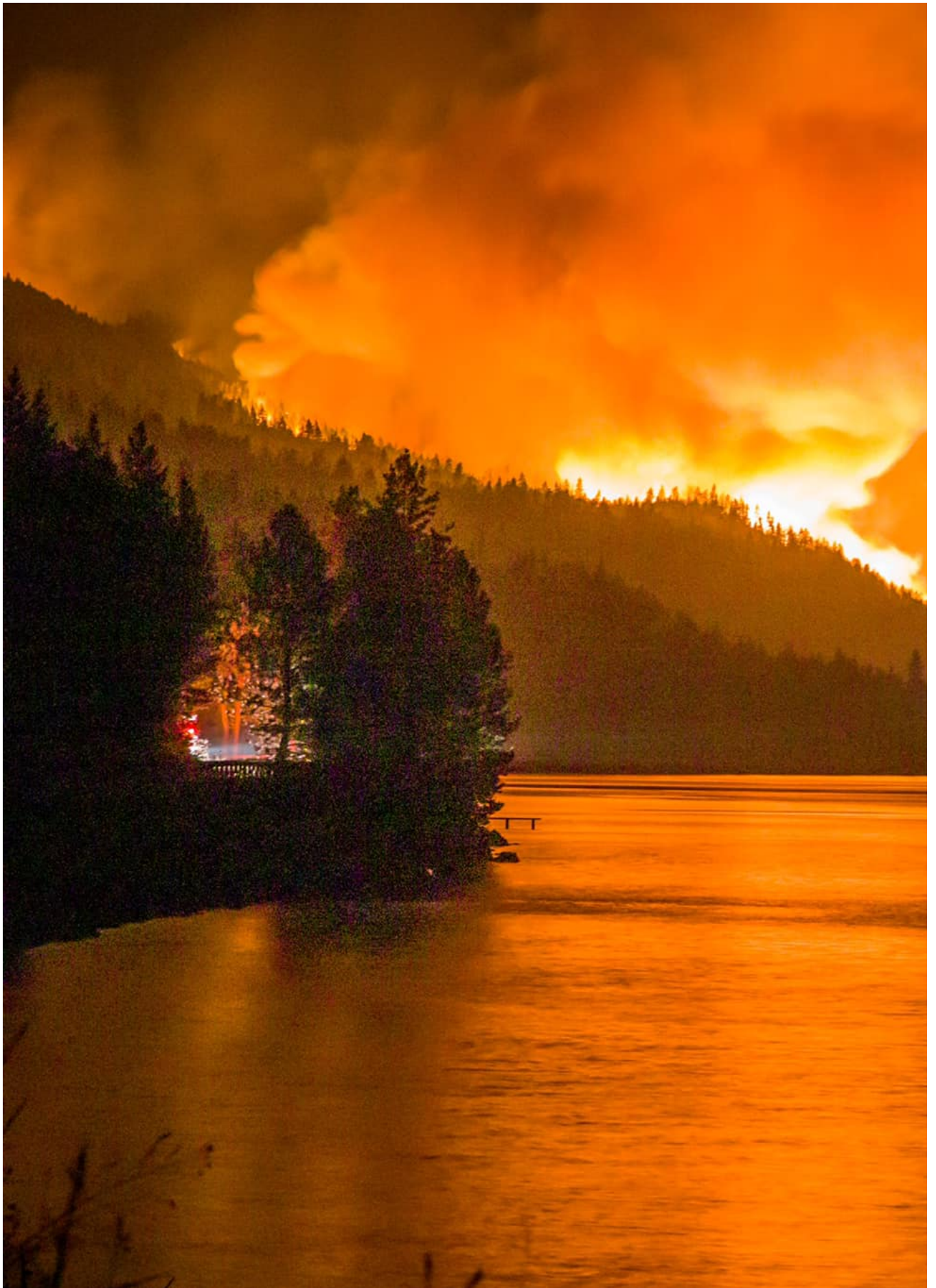
The Boulder 2700 fire on Flathead Lake.