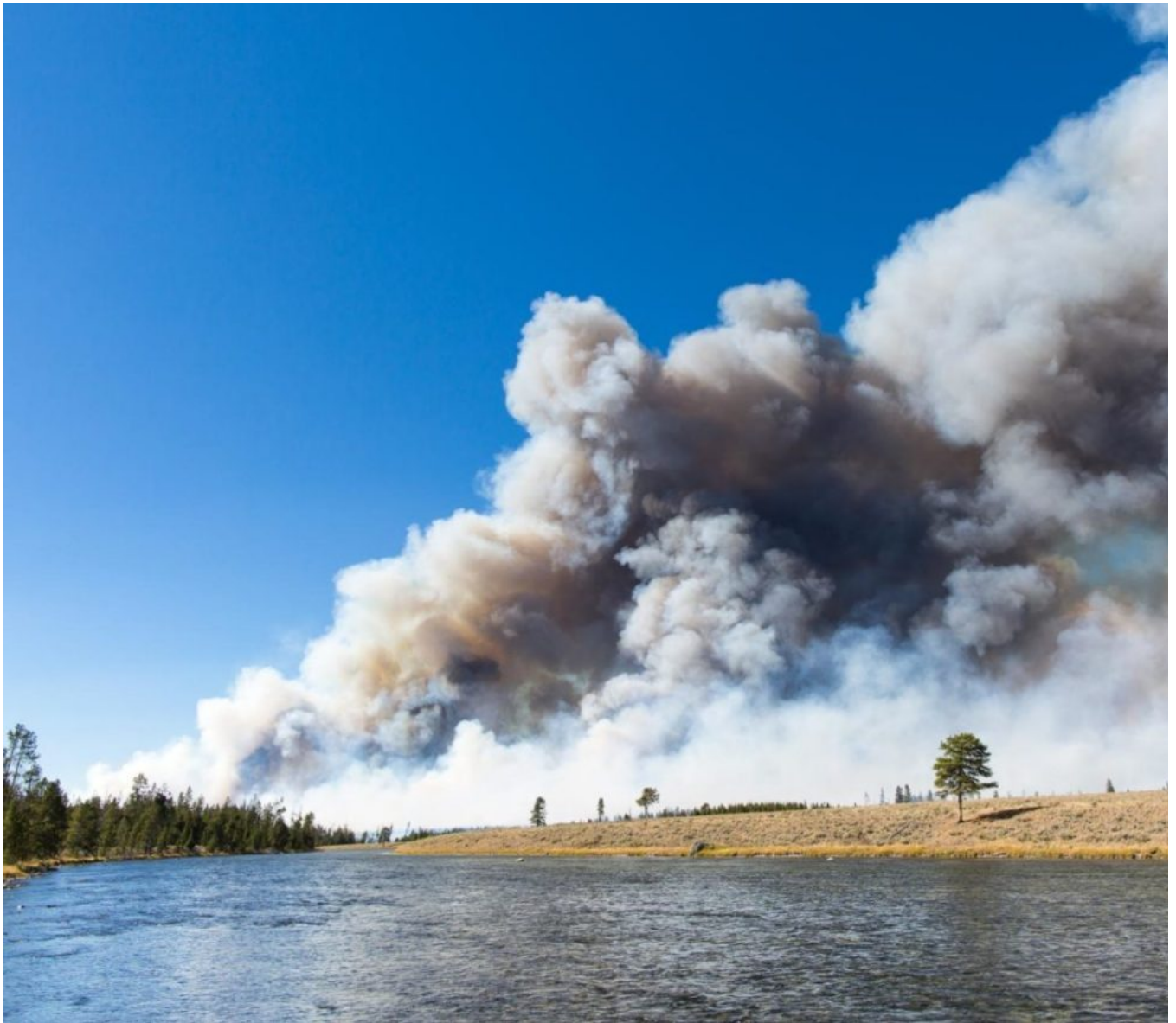
Smoke from burnout operations rises above the Madison River during the Maple Fire in Yellowstone National Park, September 10, 2016.

enough density of development that once fire starts, it could propagate from one property to another, unless those property owners have addressed the home ignition zone.”