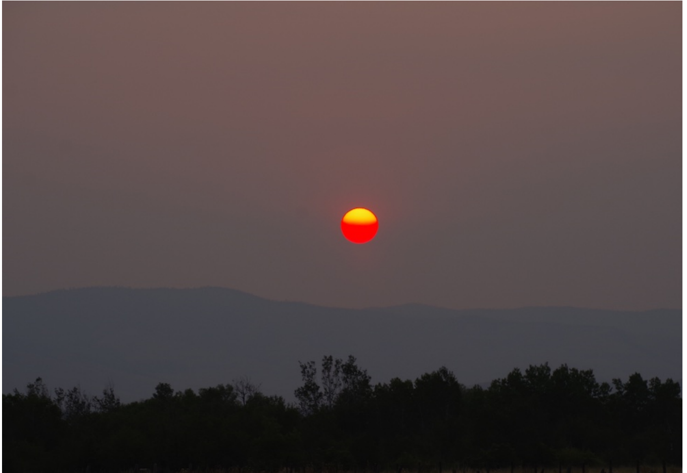
The sun sets over Montana in a blanket of smoke.