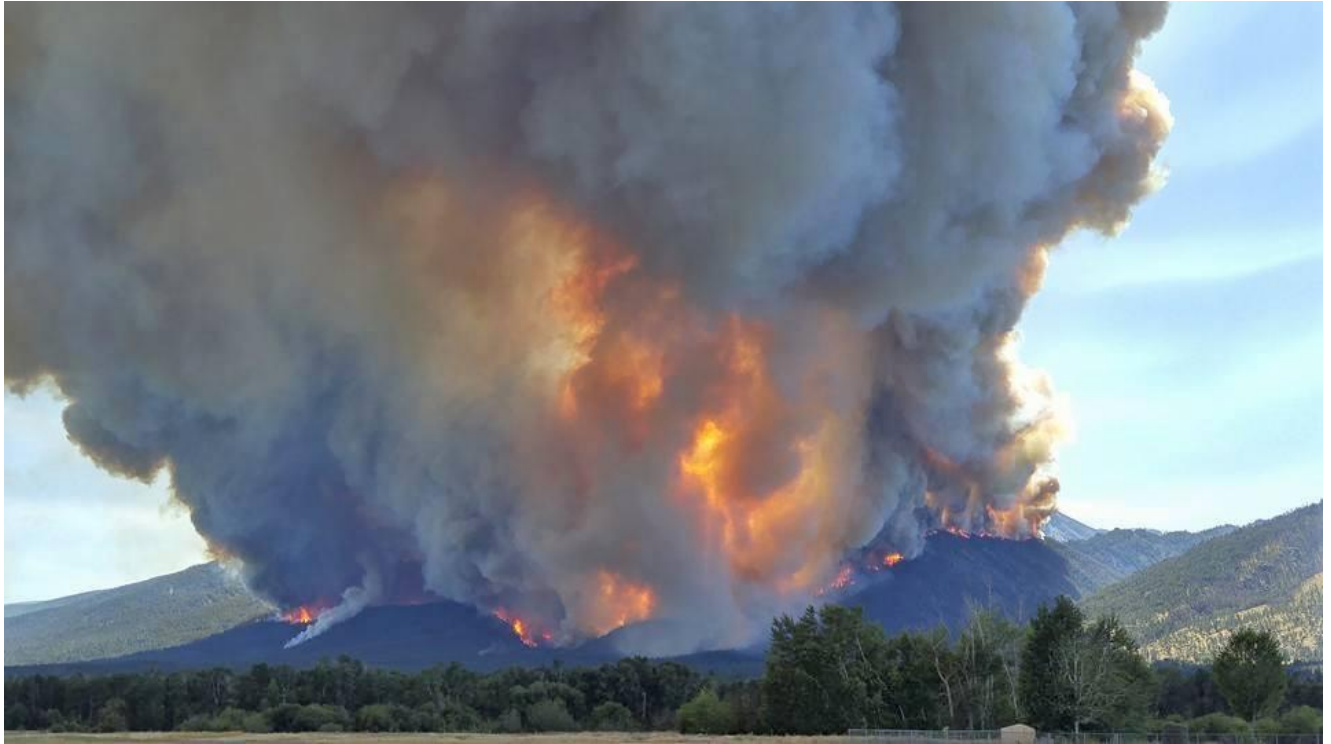
The Roaring Lion fire near Hamilton.

That's where the Wildfire Risk Task Force comes in for the Friends of Grant Creek, a neighborhood organization. A year ago, the Friends of Grant Creek recruited a handful of neighbors, some of whom have firefighting experience, to form the task force to evaluate the drainage and propose a wildfire protection plan tailored for Grant Creek.