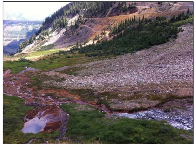
A view of Redwell Basin. The orange slopes on the upper right of the photo are a part of the Daisy Mine, the drainage tunnel is located in the lower portion of the mine waste. In the lower right of the photo, flow from the Drill Hole enters Redwell Creek. The Redwell is in the lower left of the photo.

In the early 1970s, many holes were drilled to characterize the molybdenum deposit beneath Mount Emmons. In Redwell Basin a drill hole, located in the upper portion of the basin, was improperly abandoned. The Drill Hole penetrates the molybdenum deposit and allows water to flow under pressure to the surface. It delivers poor-quality groundwater to Redwell Creek. At the Drill Hole, metal concentrations increased dramatically over upstream locations in Redwell Creek.