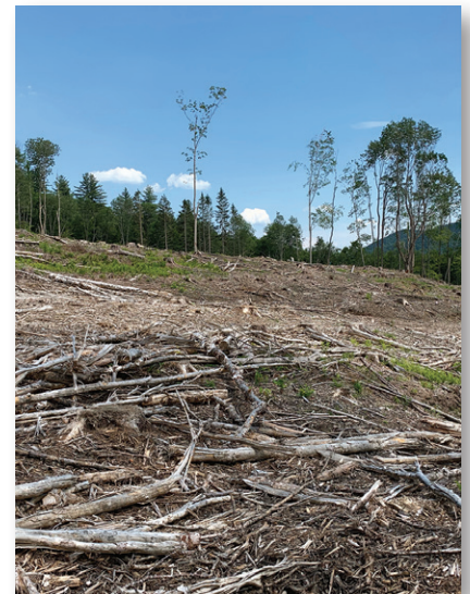
Clearcut on GMNF near Rochester, Vermont