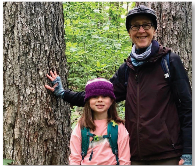
Hikers near Telephone Gap