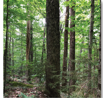
Telephone Gap trees uphill from Chittenden Reservoir