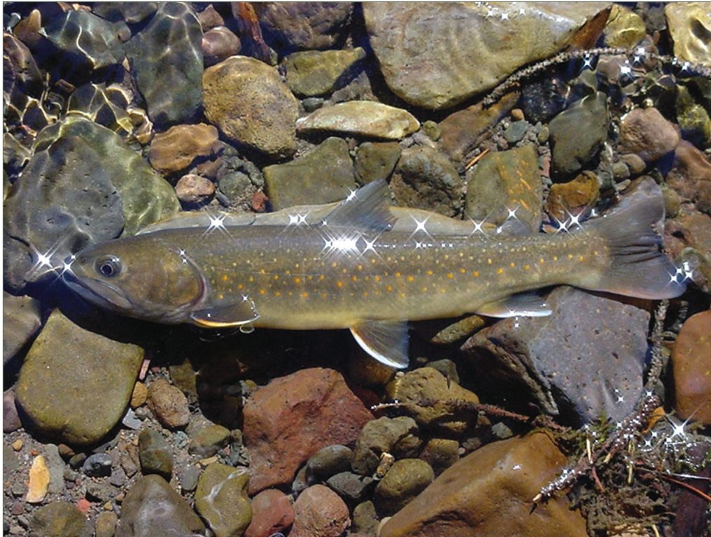
Bull trout.