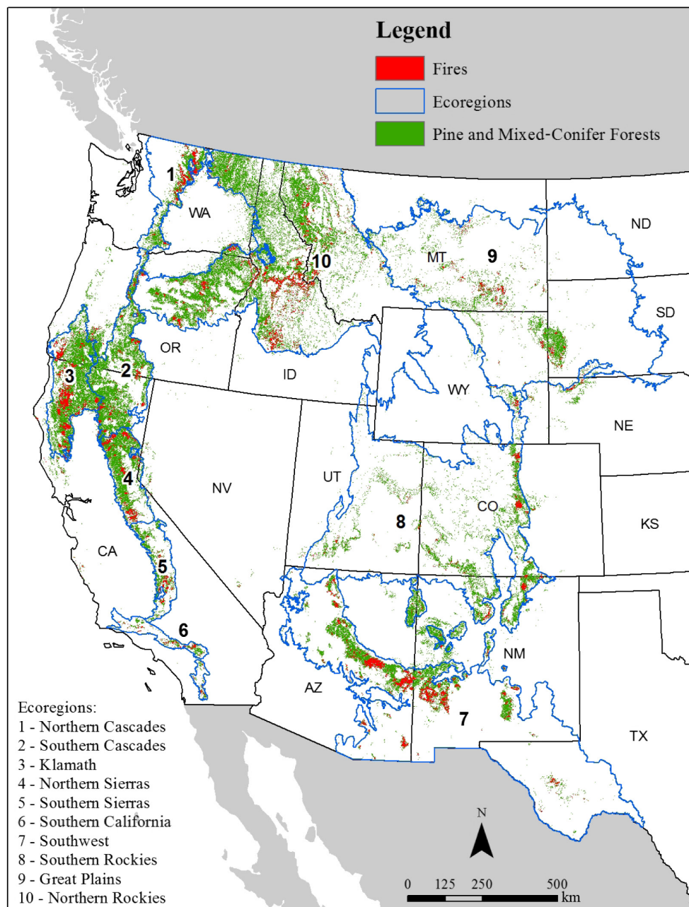
Fig. 1. Pine and mixed-conifer forests, fires, and ecoregions analyzed in this study.

measure associated changes in vegetation cover and soil characteristics. We defined burn severity with the RdNBR index because it adjusts for pre-fire conditions at each pixel and provides a more consistent measure of burn severity than dNBR when studying broad geographic regions with many different vegetation types (Miller et al.