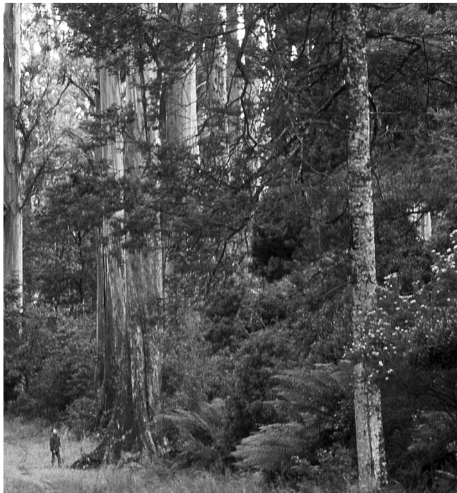
Fig. 1. E. regnans forest with midstory of Acacia and understory of tree ferns. The person in the bottom left corner provides a scale.

Highlands of Victoria, southeastern Australia has the highest known biomass carbon density in the world. We found that E. regnans forest in the O'Shannassy Catchment of the Central Highlands (53 sites within a 13,000-ha catchment) contains an average of 1,053 tonnes carbon (tC)·ha -1 in living above-ground biomass and 1,867 tC·ha -1 in living plus dead total biomass in stands with cohorts of trees >100 years old sampled at 13 sites. We examined this catchment in detail because it had been subject to minimal human disturbance, either by Indigenous people or from post-European settlement land use. We compared the biomass carbon density of the E. regnans forest with other forest sites globally by using the collated site data (Table S1). No other records of forests have values as high as those we found for E. regnans .