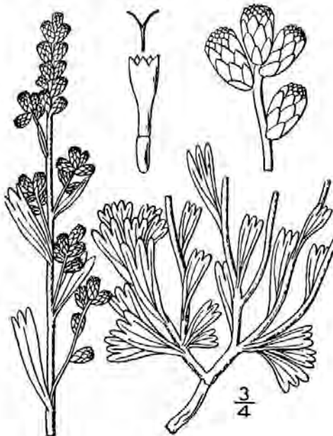
Figure 2. A drawing of big sagebrush leaves, inflorescence, flower heads and floret. (Britton, N.L., and A. Brown. 1913. An illustrated flora of the northern United States, Canada and the British Possessions . 3 vols. Charles Scribner's Sons, New York. Vol. 3: 530.)

Most sagebrush species reproduce solely by seed with only a few species able to re-sprout following fire or other disturbance. Big sagebrush, like most North American sagebrush species, flowers from late summer into autumn (see Figure 2 for a drawing of a sagebrush flower and inflorescence). From mid-autumn to early winter, fertile florets ripen into one-seeded fruits called achenes (see Figure 3).