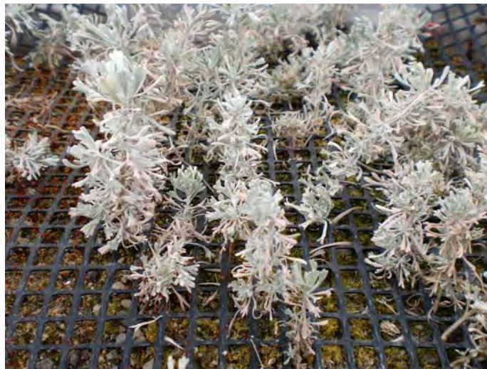
Figure 4. Big sagebrush seedlings.

On highly disturbed sites such as mine lands, cultural methods will influence sagebrush establishment. Establishment is greater on fresh as opposed to stockpiled soil most likely because of sagebrush's mycorrhizal association that aids in water and nutrient uptake from the soil. Stubble or surface applied mulch improves establishment and herbaceous competition reduces establishment. Big sagebrush density, soil resource stability, and forage production may be adequately provided when native grasses are seeded at a rate of 3.6 to 12.5 pounds per acre.