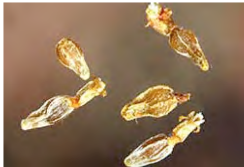
Figure 3. De-bearded sagebrush seeds about ten times their actual size.

A plant can produce 500,000 achenes, but the number is highly variable depending on the climatic conditions, competition with other plants for resources, herbivory, and seed predation among other factors. Most achenes shed within a few weeks of maturity, and generally fall within a few feet of the parent plant. Achenes have no morphological adaptations to facilitate dispersal, but because they are light weight, they can travel on wind currents over hard surfaces or snow crusts and have been reported (although it is uncommon) to disperse nearly 100 yards from the parent plant. Animals and water may also disperse achenes long distances.