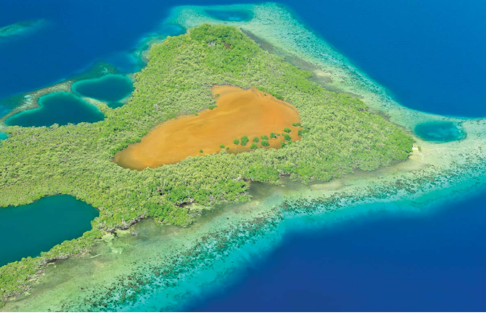
Coral and mangroves, Pelican Caye World Heritage Property, Belize