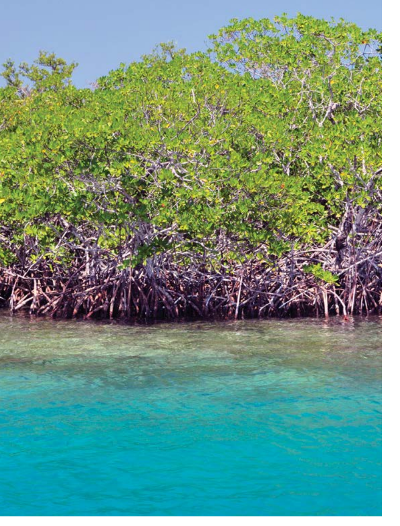
Mangroves, Pelican Cayes, Belize

are two concrete results that can become apparent in a small number of years; however, major challenges here are that a generation or more of people have grown up believing that the highly degraded ecosystems covering most settled parts of the peninsula are 'natural'. Policy changes rely not only on proof that protection and restoration can work, but also on a long-term effort to build understanding about ecology in the countries concerned.