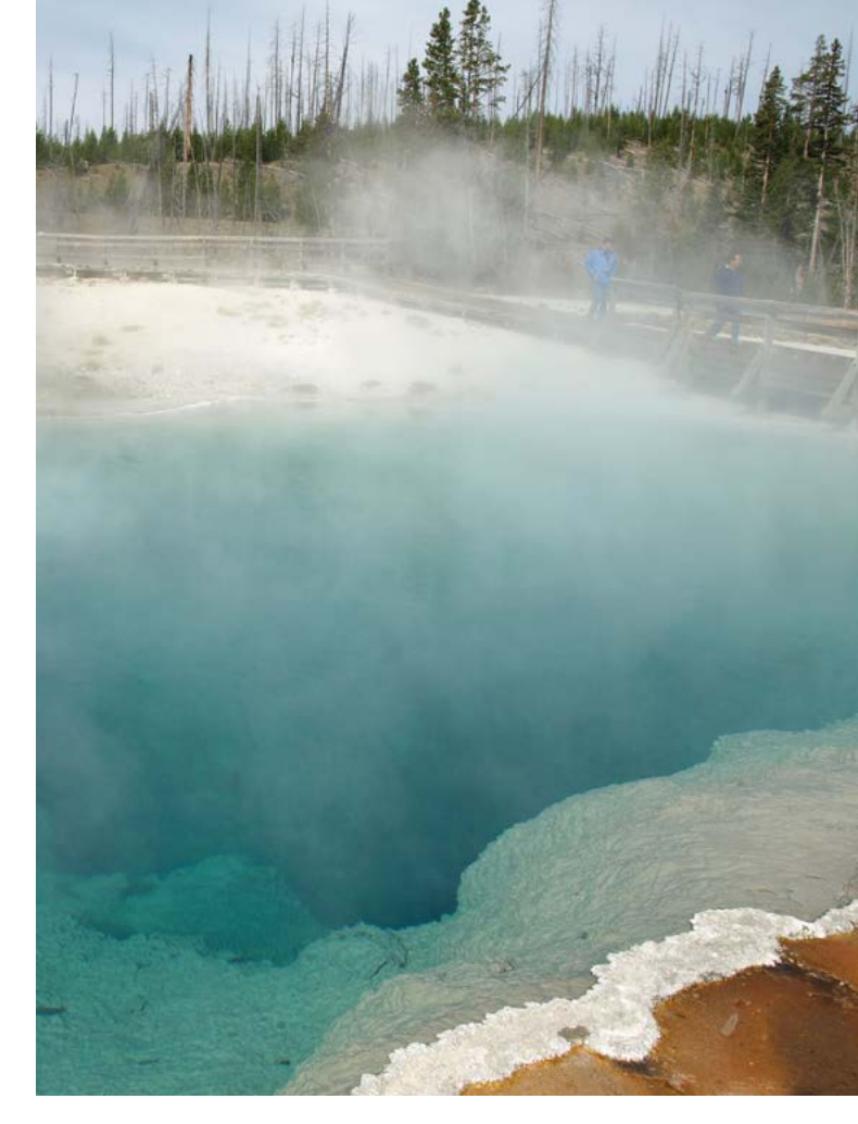
Aesthetic translucent blue of a geothermal boiling water pool, Yellowstone National Park, USA

Many conflicts between nation-states focus on the borders between countries. The first trans-boundary conservation initiative in the modern sense of the term is attributed to the Waterton–Glacier International Peace Park, which was declared in 1932 to commemorate the peace and