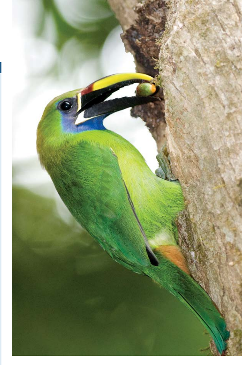
Emerald toucanet ( Aulacorhynchus prasinus ), Monteverde Cloud Forest Reserve, Costa Rica

We summarise information on several techniques for quantifying and valuing benefits in economic and other terms below. But the benefits also need to be understood in the context of competing benefits (so-called tradeoffs)—for example, retaining a forest to protect water also means that the timber in the forest is not available for sale or the land for conversion to agriculture or development—and that these benefits and their relative values accrue to different people. One of the persistent challenges in securing ecosystem services is that many services maintained by sustainable management or