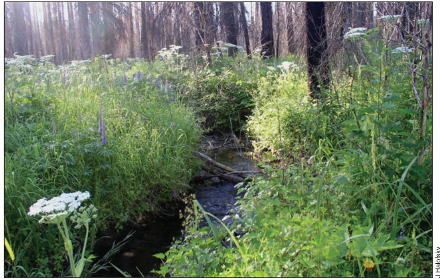
Figure 6. Streams within early-successional forest ecosystems contrast with forest-dominated reaches in many ecosystem attributes, including physical parameters (temperature and insolation), structure, plant and animal composition, and ecosystem processes, such as primary productivity.

Rates and patterns of geomorphic processes, such as erosion and nutrient leaching losses, are also different between ESFEs and later successional stages. Tree death results in a loss of root strength that is critical for stabilizing soils and deeper rock layers on mountain slopes (Perry et al. 2008). Erosion and landslides may occur at higher rates in ESFEs, contributing to the variability of sediment budgets in watersheds (Reeves et al. 1995) and creating long-lasting substrates for ruderals. While enhancing erosion processes, ESFEs also provide materials and processes that counteract this effect, such as woody debris, which retain sediments and organic materials, and surviving vegetation, which stabilizes slopes and nutrient stores (eg Bormann and Likens 1979).