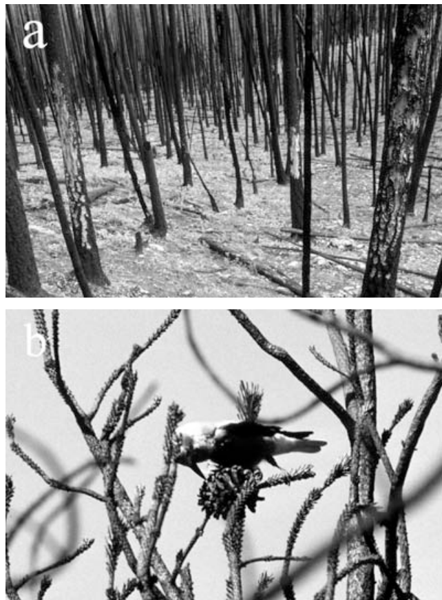
Figure 1. (a) Marks on burned trees left by woodpeckers that fed extensively on wood-boring beetle larvae in the snags. (b) Clark's Nutcracker ( Nucifraga columbiana ), a postfire specialist that has evolved a sublingual seed pouch that can hold more than 100 seeds, is extracting seeds from an underappreciated seed source—severely burned ponderosa pine.

Even if the spatial scale over which stand-replacement fires occur in the lower-elevation conifer forest types is greater now than in the historic past, that is not to say that the presence of crown fires represents a process that is unnatural. Severe fires are clearly natural, and they constitute an important part of the fire regimes associated with most western conifer forest types (Arno 1980;