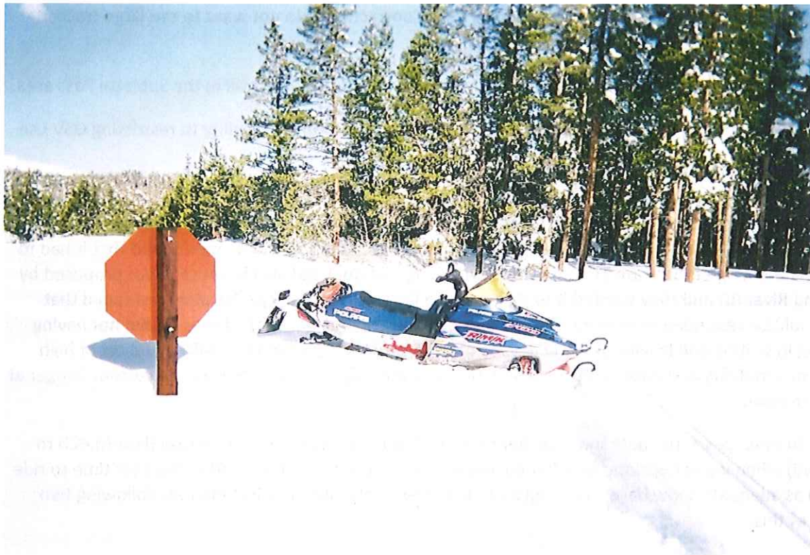
Figure 2. At Worthen Meadows Rd./CD Trail Junction 5/14/2010