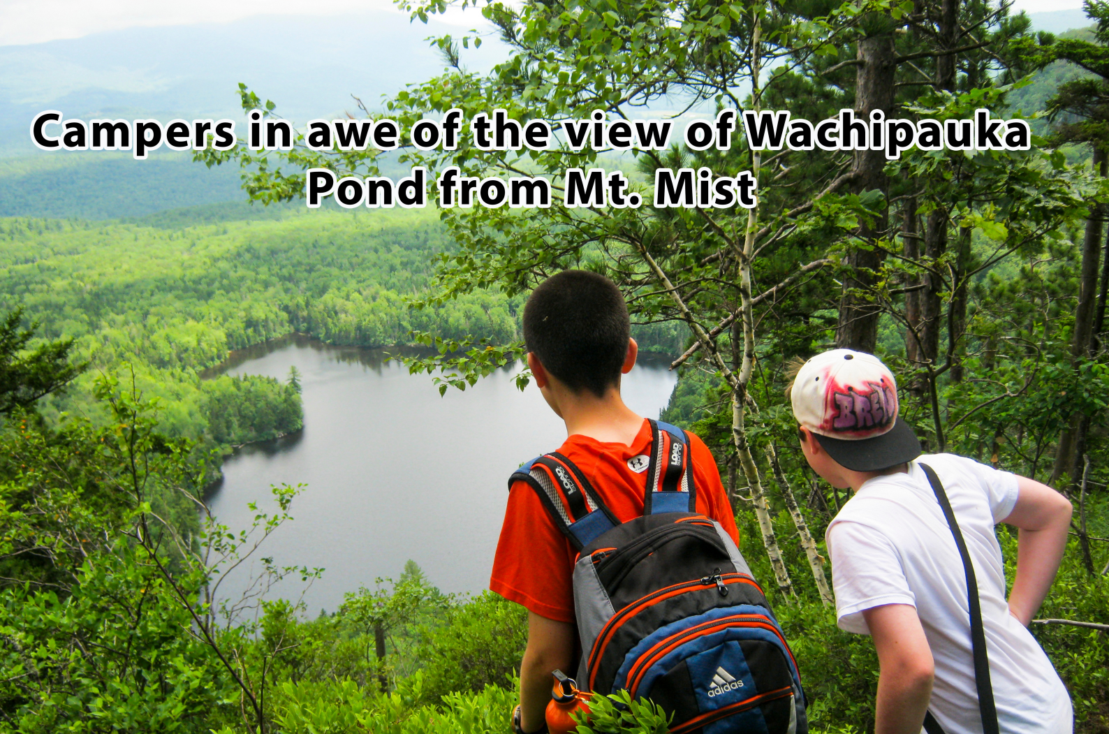
Campers in awe of the view of Wachipauka Pond from Mt. Mist