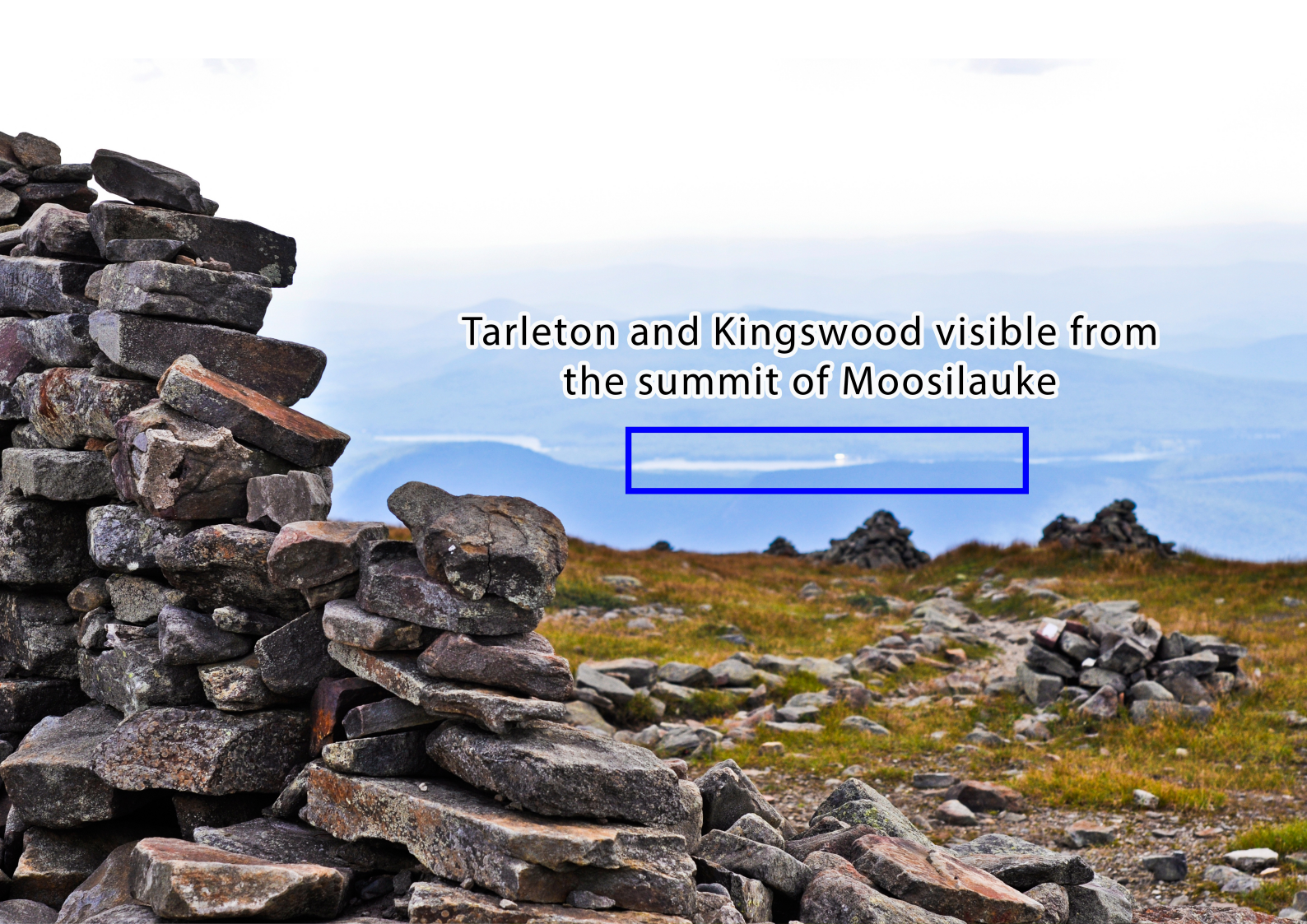
Tarleton and Kingswood visible from the summit of Moosilauke