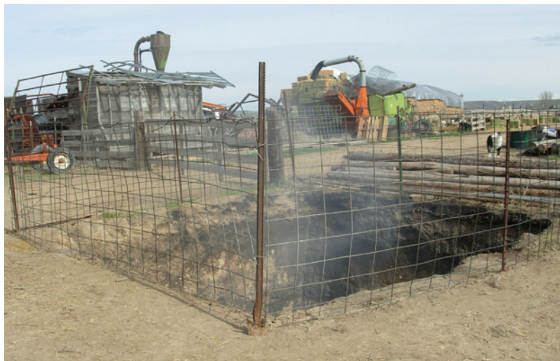
Fencing around a deep carcass pit is an added barrier to wolves and other scavenging predators drawn to the area.