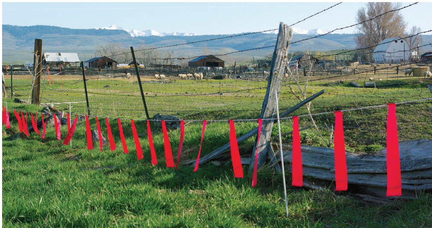
Turbofladry, fladry hung along electrified fencing, adds the element of shock, boosting the effectiveness of the fladry barrier.

For livestock kept in large enclosures or on open range, permanent fences are typically too costly to build and maintain. In addition, permanent fences are not portable and of little use with freely roaming livestock. For example, using predator deterrent fencing such as electric woven wire, multistrand, high railing, or similar obstructions on open-range grazing allotments is usually not allowed on public lands, is very expensive and can injure deer and other wildlife. Some of these allotments are on national forests in the northern Rockies—also prime wolf and bear territory—and have some of the highest livestock losses to predators. Livestock in this area are often moved on a seasonal basis or grazed on open ranges during the spring, summer and fall.