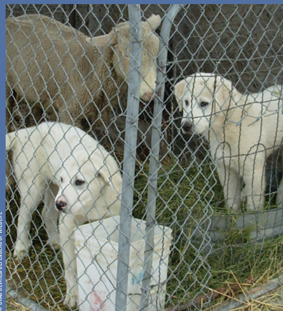
Guarding dogs raised with livestock bond with their charges.

Follow these training guidelines and your dogs will learn important lessons during the development period when they are most responsive to people and to livestock.