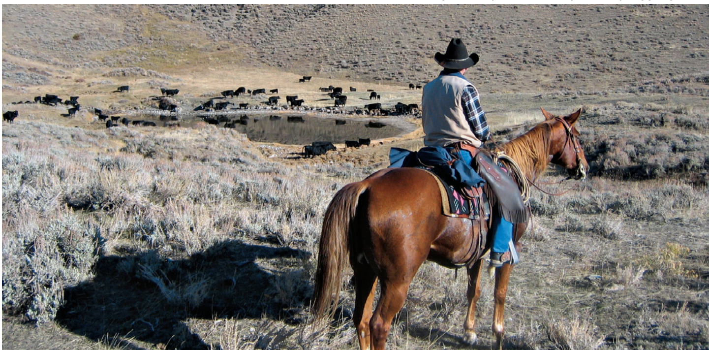
A range rider surveys a livestock watering hole on a Wyoming grazing allotment.

Increasing the wolf's perception of risk can help reduce the chances of livestock losses, but working proactively to prevent wolves and other predators from being attracted to your livestock operation in the first place (see Chapter 2) is often the best strategy.