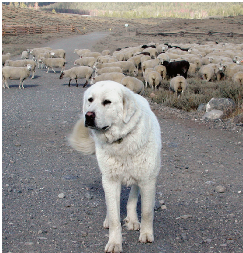
A Great Pyrenees stands guard on an Idaho sheep ranch.