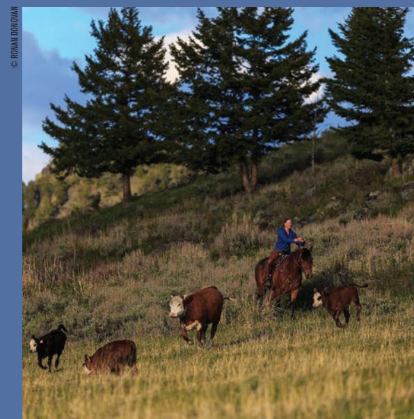
A range rider monitors a herd in Montana.

Low-stress livestock handling is proving to be a viable option for improving rangeland health and grazing management and potentially reducing livestock losses to predators.