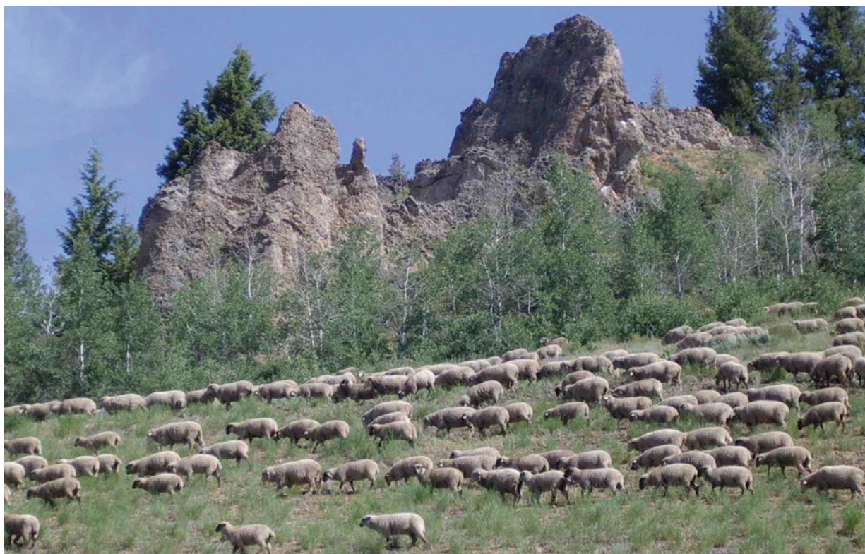
Sheep move through a grazing allotment in Idaho's Sawtooth National Forest.