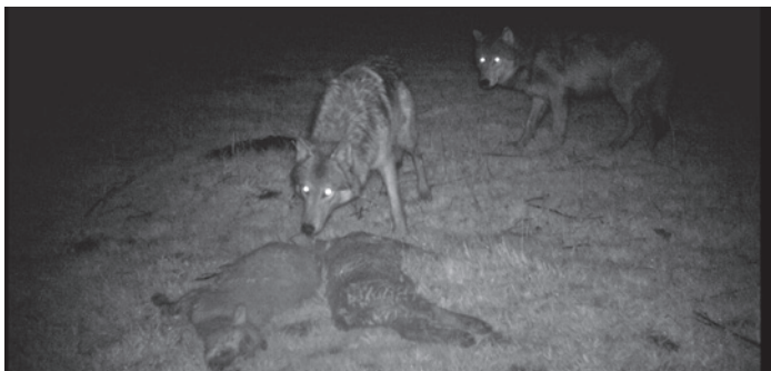
A trail camera captured these wolves attracted by the carcass of a sheep. Scavengers as well as predators, wolves are drawn to dead animals.

Hauling away, burying or burning livestock carcasses rather than leaving them in the field to decay reduces the chances of attracting scavengers. It also limits the food supply in the area, which can reduce the number of scavengers in general. Once a wolf becomes used to a food source, such as dead livestock, it is more difficult to stop it from returning to look for an easy meal. Other attractants include sick or dying livestock, birthing areas and, oddly enough, domestic adult ram sheep. Wolves often target domestic rams over ewes and lambs. Wolf managers don't know yet why this occurs, but it happens frequently enough to warrant consideration.