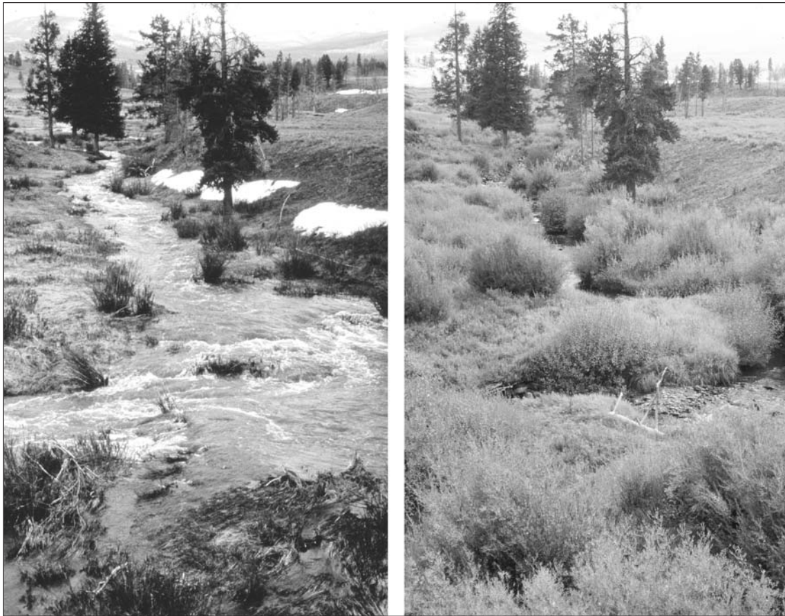
Figure 6. Willow along Blacktail Creek in spring 1996 (left) and summer 2002 (right). Following a 70-year period of wolf extirpation, heavy browsing of willows and conifers is evident in the 1996 photograph. In 2002, after 7 years of wolf recovery, willows show evidence of release from browsing pressure (increases in density and height).