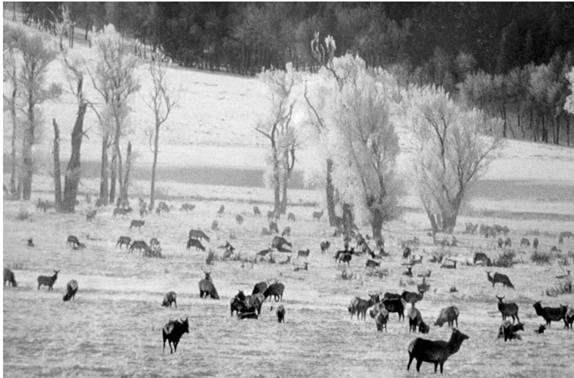
Figure 2. Elk browsing among cottonwood trees in the wintertime along the Lamar River in the northern range of Yellowstone National Park during the period when wolves had been extirpated. Note the lack of recruitment of small and intermediate-sized cottonwood trees that has occurred over many decades and the general lack of vigilance indicated by the elk.

continued until the present, with data missing for some years. With the removal of predation and associated predation risk effects following the extirpation of wolves, elk in the northern range had a significant impact on the recruitment of deciduous woody species. As a consequence, recruitment of upland aspen and riparian cottonwood soon crashed (figure 1c). This loss of recruitment continued over multiple decades, even though sport hunting of elk occurred each winter when some of the elk left the park, and park administrators deliberately sought to reduce the elk population from the mid-1920s to 1968 (figure 1b).