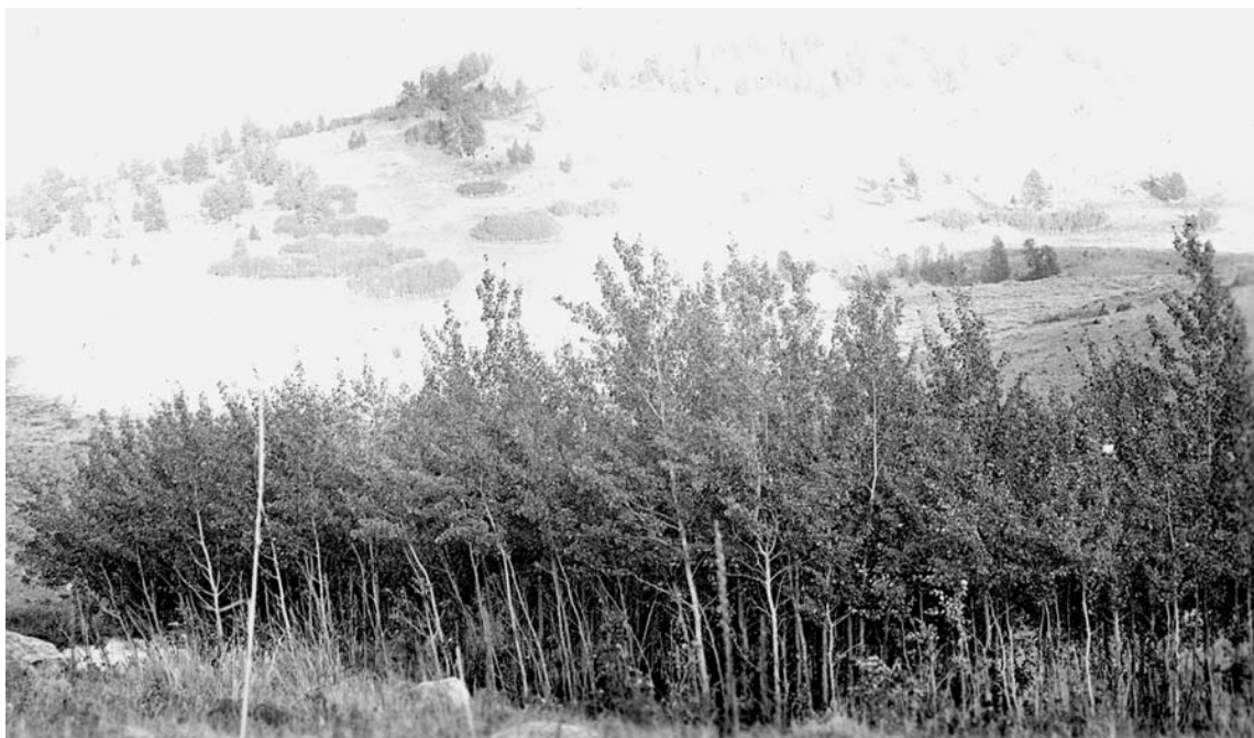
Figure 3. Photograph taken in 1900 near Tower Junction on the northern range of Yellowstone National Park, showing evidence of elk browsing on the outer stems of a 3- to 5-meter-tall aspen thicket in the foreground and multiple aspen thickets on a distant hillslope (Meagher and Houston 1998). We hypothesize that dense regeneration after wildfire resulted in high levels of predation risk in the interior of aspen thickets; thus, browsing is evident only along the outer edges of the thicket. Even following the widespread fires of 1988, such aspen thickets are not common on the northern range.

represented hunting kills outside the park. Seasonal sport hunting just outside the park boundary may have caused some elk to remain within the park instead of following former down-valley migrations (Barmore 2003). However, by the late 1960s, when the elk population had been reduced, recruitment of woody browse species did not occur (figure 1c).