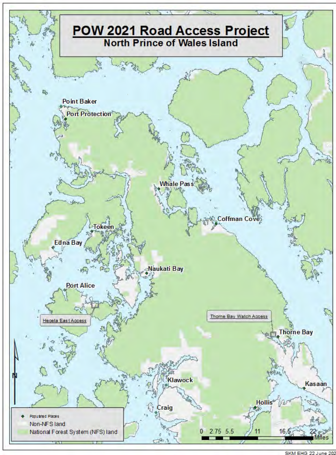
Figure 1. General Location Map.